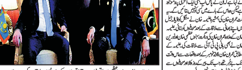
ایران، نائب وزیر اعظم اسحاق ڈار سے تازہ گفتگو کے دوران عمران خان سے مل کر رہے ہیں

میرے پاس اب بھی ایک آخری پتہ ہے، عمران خان لاہور (بیورو رپورٹ) عمران خان نے کہا ہے کہ میرے پاس اب بھی ایک آخری پتہ ہے۔ انہوں نے کہا کہ حکومت نے اس بارے میں فیصلہ کر لیا ہے کہ پبلک سکولوں کو 8 بجے سے کھولنے کی اجازت دی جائے گی۔