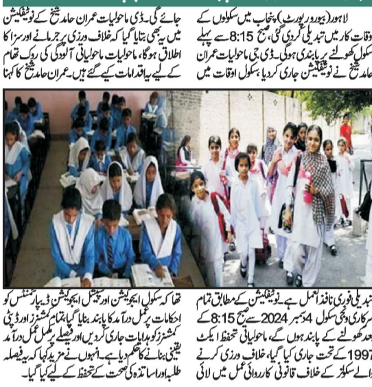
تہذیبی فریڈم ڈیپارٹمنٹ کے ملازمین نے سرکاری سکولوں میں سکولوں کے کھولنے کے لیے پبلک سکولوں کو 8 بجے سے کھولنے کی اجازت دی گئی ہے۔

اسلام آباد (ضلع رپورٹر) وفاقی وزیر داخلہ محمد نواز خان نے کہا ہے کہ انہدام اور قانونی امور کی روک تھام کیلئے اقدامات کئے جائیں گے۔ انہوں نے کہا کہ حکومت نے اس بارے میں فیصلہ کر لیا ہے کہ پبلک سکولوں کو 8 بجے سے کھولنے کی اجازت دی جائے گی۔