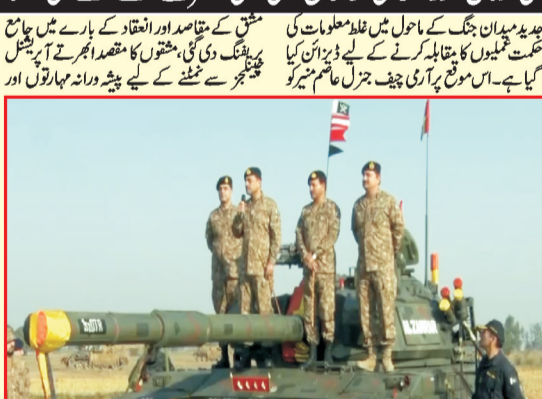
اسرائیلی حملوں میں مزید 11 لبنانی شہید، حزب اللہ کا بھرپور جواب

پاک فوج قوم کی پر عزم حمایت سے ملکی دفاع اور سلامتی کو لائق کسی بھی خطرے سے نمٹنے کی صلاحیت رکھتی ہے، جنرل عامر منیر نے کہا ہے کہ پاکستان کی فوج قوم کی پر عزم حمایت سے ملکی دفاع اور سلامتی کو لائق کسی بھی خطرے سے نمٹنے کی صلاحیت رکھتی ہے۔