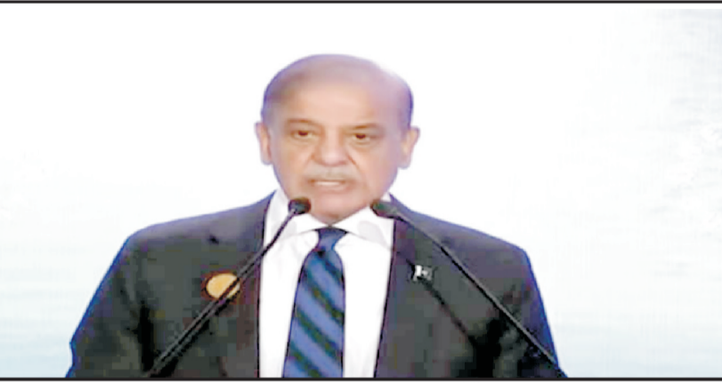
ریاض، وزیر اعظم شہباز شریف "دن وانڈرٹرسٹ" سے خطاب کر رہے ہیں

پنجاب میں سوا 8 بجے سے پبلک سکول کھولنے پر پابندی کو ٹھیکیشن جاری لاہور (بیورو رپورٹ) پنجاب میں سکولوں کے کھولنے کے لیے پبلک سکولوں کو 8 بجے سے کھولنے کی اجازت دی گئی ہے۔ وزیر اعلیٰ پنجاب محمد شہباز شریف نے اس بارے میں ایک پریس کانفرنس میں کہا کہ حکومت نے اس بارے میں فیصلہ کر لیا ہے کہ پبلک سکولوں کو 8 بجے سے کھولنے کی اجازت دی جائے گی۔