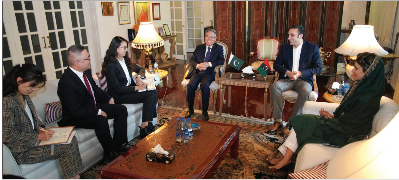
ISLAMABAD: Chinese Ambassador to Pakistan Jiang Zaidong arrived at Zardari House in Islamabad to meet Pakistan People's Party (PPP) Chairman Bilawal Bhutto Zardari on Tuesday.

The government remains focused on maintaining economic stability and fulfilling all obligations under the IMF program with diligence and transparency, aiming to lay the foundation for stronger, sustainable and inclusive growth, it added.