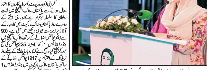
لاہور، وزیر اعلیٰ پنجاب مریم نواز اختر پنجاب پروگرام کی افتتاحی تقریب سے خطاب کر رہی ہیں

سٹاک ایکسچینج میں تیزی، ایٹریکس 11 لاکھ 4 ہزار پوائنٹس کی تصفیہ کار پار گیا کراچی (بیورو رپورٹ) سٹاک ایکسچینج میں تیزی دیکھی گئی ہے۔ ایٹریکس 11 لاکھ 4 ہزار پوائنٹس کی تصفیہ کار پار گیا ہے۔