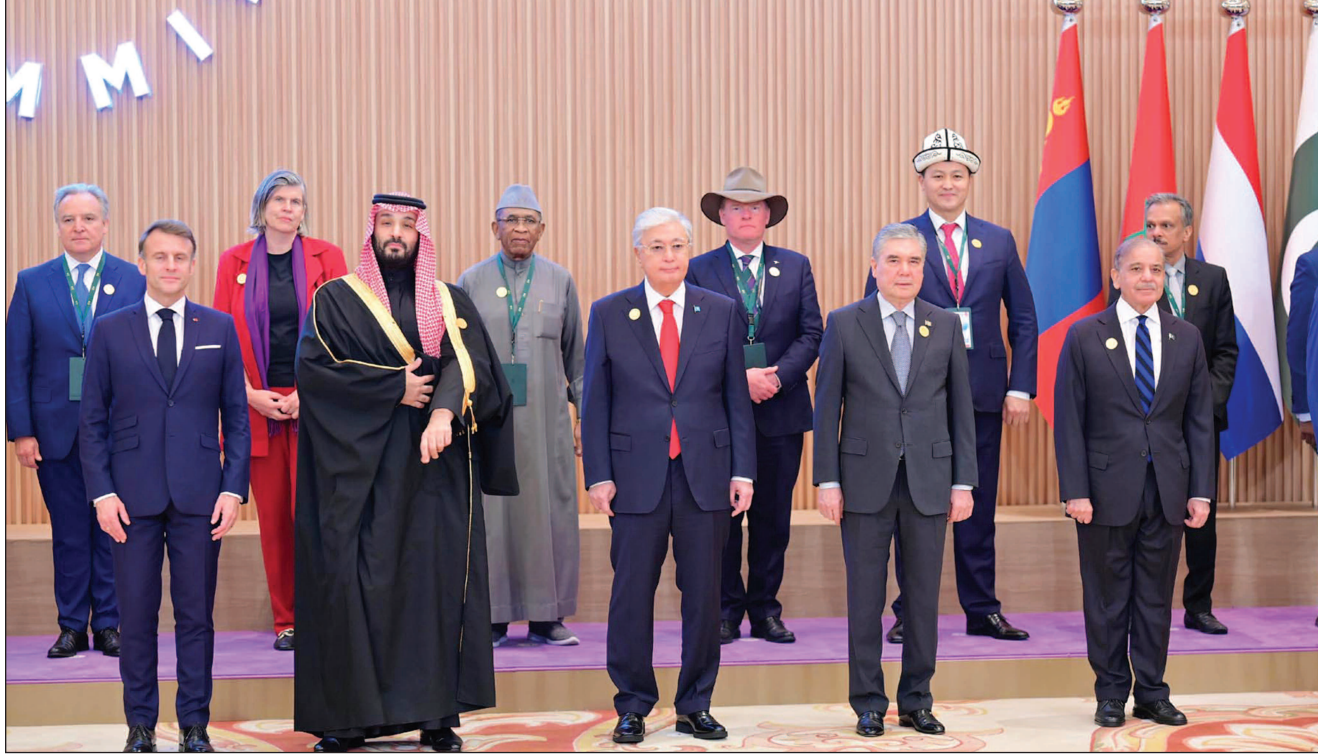
RIYADH: Prime Minister Muhammad Shehbaz Sharif in the family photo of the One-Water Summit being held.

The COAS spent the day in the field alongside the troops, commending their training standards, operational readiness, and high state of morale. Earlier, upon his arrival at the exercise area, the COAS was welcomed by the Commander Gujranwala Corps and the Inspector General of Training and Evaluation. PR