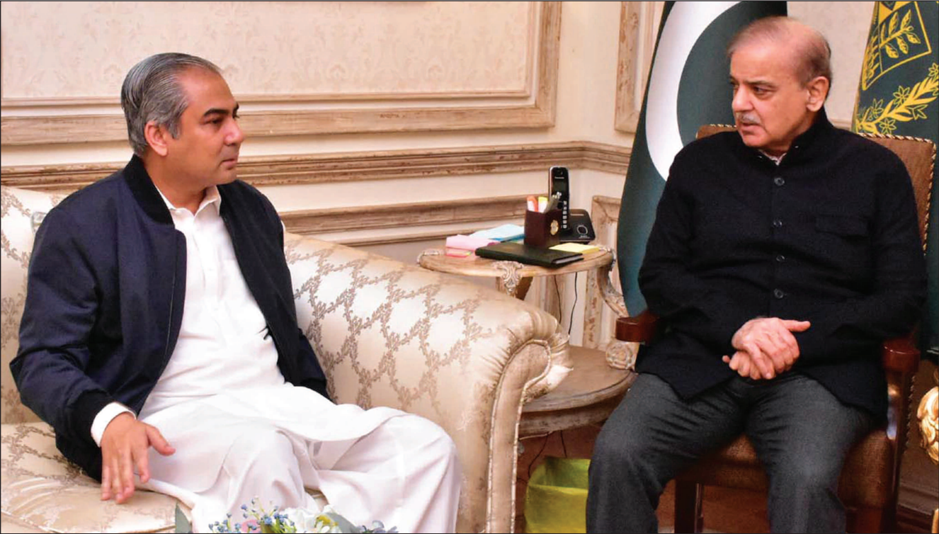
LAHORE: Federal Interior Minister Syed Mohsin Raza Naqvi called on PM Muhammad Shehbaz Sharif.

"Furthermore, it is regrettable that they resort to politicizing tragic events, spreading misinformation to the international media and engaging in false propaganda that ultimately harms the country's image".