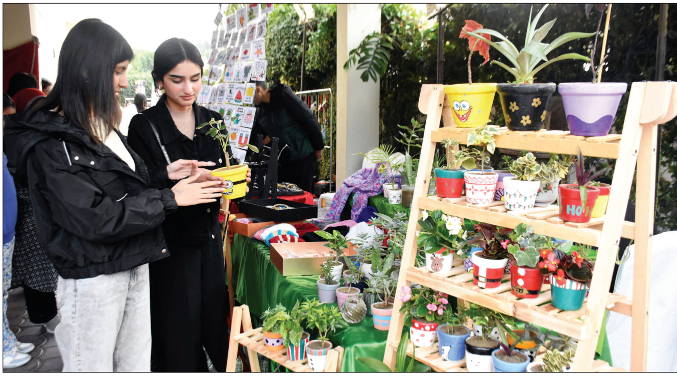
ISLAMABAD: Girls watching handmade items on a stall in Winter Left Christmas Market at sector F-8, in the Federal Capital.