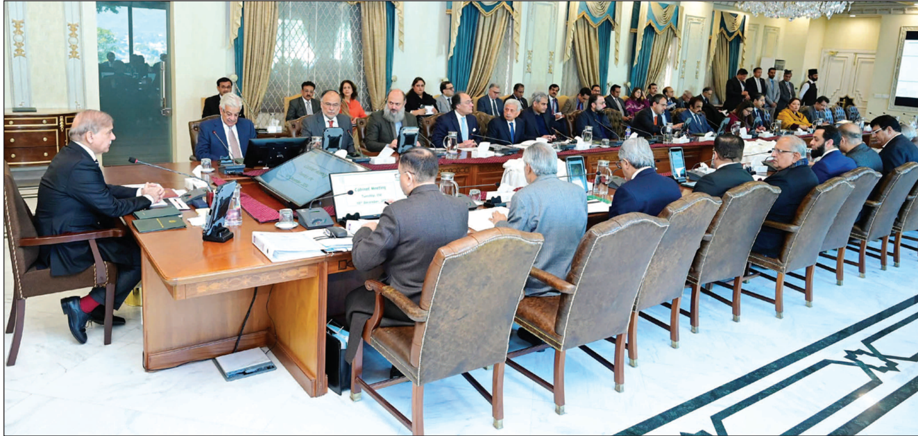
ISLAMABAD: Prime Minister Muhammad Shehbaz Sharif chairs the Federal Cabinet Meeting.

The Exercise Cambrian Patrol, conducted in the unforgiving mountainous terrain of mid-Wales, United Kingdom, is an arduous test of physical endurance, tactical acumen, and mental fortitude. It emphasizes teamwork, leadership, self-discipline, courage, and determination under the most demanding operational scenarios, serving as a benchmark for military excellence. PR