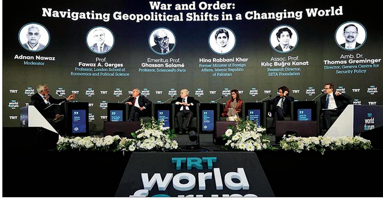
ISTANBUL: Chairperson National Assembly Standing Committee on Foreign Affairs Hina Rabbani Khar participated in a panel discussion titled 'War and Order: Navigating Geopolitical Shifts in a Changing World' at TRT World Forum held in Istanbul.

Root Hayat said that IRM has been able to impart employable skills to more than 1.5 million youth across the country and the region.