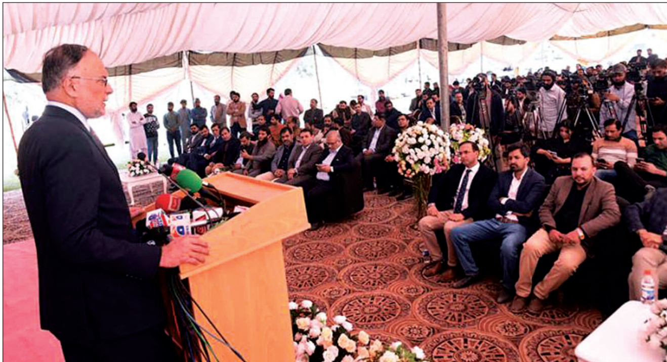
LAHORE: Federal Minister of Planning and Development, Prof. Ahsan Iqbal is addressing the Foundation laying ceremony of Information Technology University's (ITU) new Block at Barki Road. (Story on page 4)

The meeting also considered the joint efforts of the three countries of Pakistan, Azerbaijan and Türkiye, while on the instructions of Federal Minister for Investment Abdul Aleem Khan, it was also decided to nominate a Focal Person from the Board of Investment to maintain close liaison with the Government of Azerbaijan.