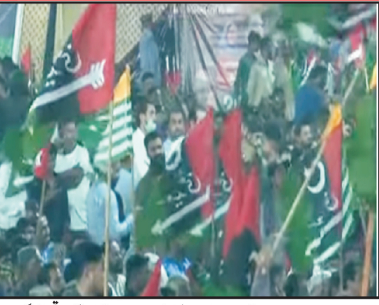
مریم نواز اور دیگر اہلکار