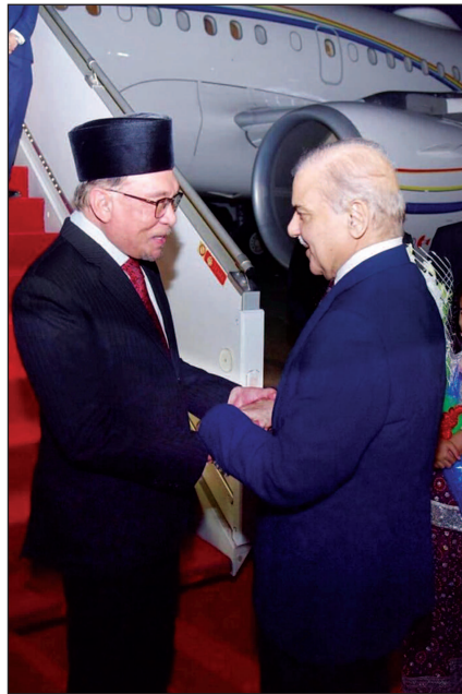
Prime Minister's visit to Pakistan had been successfully resolved.

He noted with satisfaction that most of the trade issues highlighted during the Malaysian