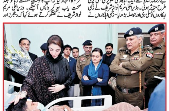
مریم نواز شریف

وزیر اعلیٰ مریم نواز نے زہر علاج رینجرز اور پولیس کے زخمی ہلاکاروں کی عیادت کی۔