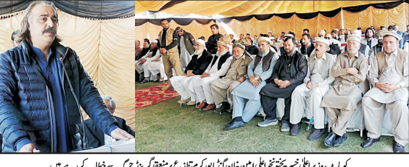
وزیر اعلیٰ خیبر پختونخوا

خیبر پختونخوا میں وفاق اور صوبے کے درمیان اختلافات اپنی جگہ ہیں، وفاق کو ایف سی پلانوں کو مزید فراہم کرنے کی درخواست کی گئی ہے۔