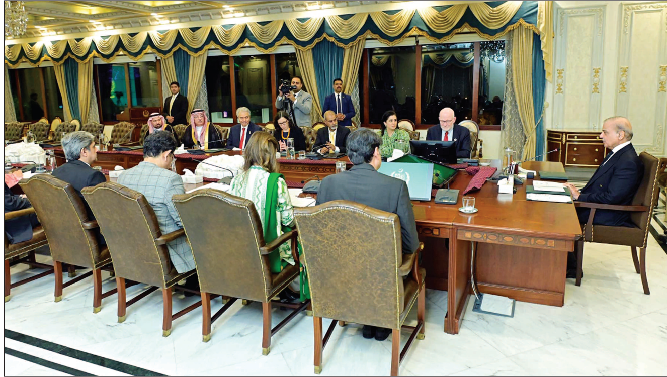
ISLAMABAD: A delegation of Polio Oversight Board calls on Prime Minister Muhammad Shehbaz Sharif.