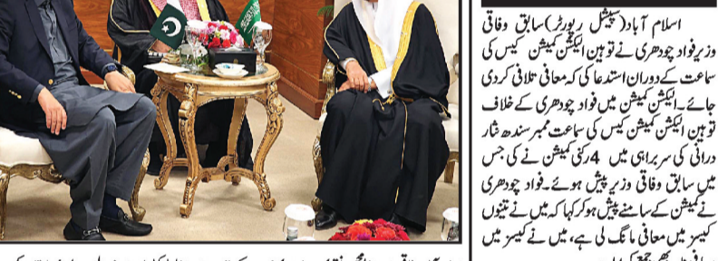
اسلام آباد، وزیر اعلیٰ پنجاب، فضل الرحمان، نے وفاقی قوتوں سے توشہ خانہ کی ضمانت منظور کرنے کا فیصلہ کیا ہے، جس سے عمران خان کی ضمانت منظور کرنے کے بعد وہ رھائی کا حکم حاصل کریں گے۔