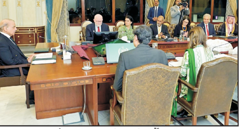
اسلام آباد، وزیر اعلیٰ پنجاب، فضل الرحمان، نے وفاقی قوتوں سے توشہ خانہ کی ضمانت منظور کرنے کا فیصلہ کیا ہے۔

اسلام آباد (پبلشنگ رپورٹ) وزیر اعلیٰ پنجاب، فضل الرحمان، نے کہا ہے کہ پہلی آئی کے احتجاج کی کان کا وقت مناسب نہیں ہے۔ انہوں نے کہا کہ حکومت نے وفاقی قوتوں سے توشہ خانہ کی ضمانت منظور کرنے کا فیصلہ کیا ہے، جس سے عمران خان کی ضمانت منظور کرنے کے بعد وہ رھائی کا حکم حاصل کریں گے۔