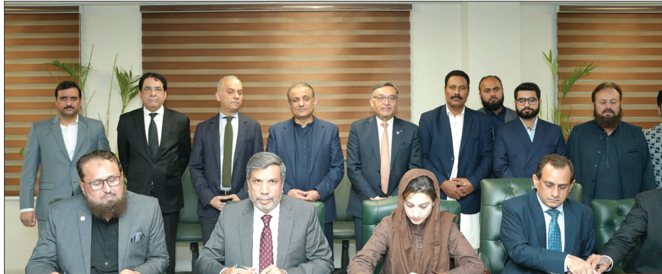
LAHORE: Federal Minister for Privatisation Abdul Aleem Khan in the signing event of successful privatisation of Services International Hotel.