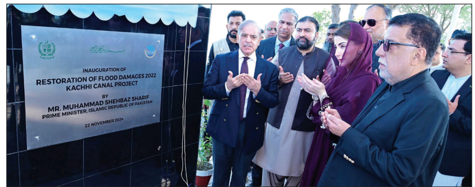
TAUNSA BARRAGE/KOT ADDU: Prime Minister Muhammad Shehbaz Sharif unveils the plaque of restoration of Kachhi Canal. (Story on page 1)

She while addressing inauguration ceremony of the Kachhi Canal Rehabilitation Project said, "The Kachhi Canal Rehabilitation project was completed in a record period of 45 days owing to 'Shahbaz Speed'. I congratulate all the stakeholders on this achievement. Kachhi Canal is not a mere canal going from Punjab to Balochistan but a path of development and prosperity. The land of Balochistan will be irrigated with the water of Kachhi Canal and people will become prosperous. The Kachhi Canal Project had been completed in 2017 during the tenure of Nawaz Sharif."