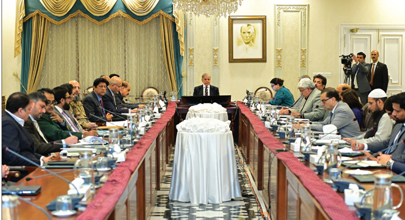
ISLAMABAD: Prime Minister Muhammad Shehbaz Sharif chairs a review meeting regarding reforms in Information Technology sector.