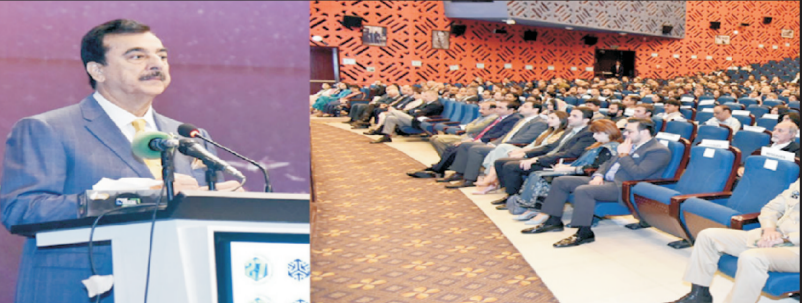
اسلام آباد، قائم مقام صدر ایف یوسف رضا گیلانی کا میٹنگ روم میں کابینہ کا اجلاس جاری ہے۔

لاہور کا ایک لوڈ ترین شہر میں دوسرا نمبر، سموگ کی اوسط شرح 414 ریکارڈ کی گئی ہے۔ حکومت نے سموگ کے خلاف سخت اقدامات کیے ہیں۔