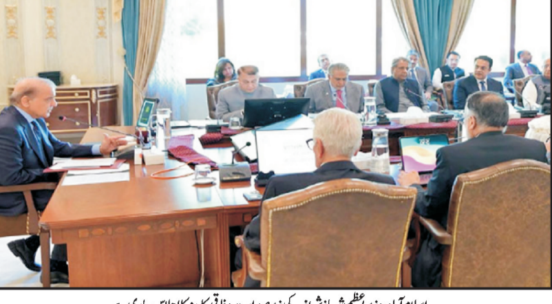
اسلام آباد، وزیر اعظم شہباز شریف کی زیر صدارت وفاقی کابینہ کا اجلاس جاری ہے۔

لندن (این این ڈی) (ڈیک) لند میں پاکستان ہائی کمیشن کی گاڑی پر حملے کا مقدمہ درج کیا گیا ہے۔ پولیس نے تحقیقات کا آغاز کیا ہے۔