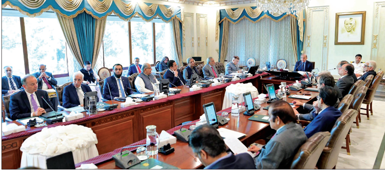
ISLAMABAD: Prime Minister Muhammad Shehbaz Sharif chairs the Federal Cabinet Meeting.

He said: "In recent years, we've endured immense trials; the Covid-19 pandemic halted global life, testing even the most advanced health systems. Then, the Ukraine war disrupted energy supplies, raising costs and impacting economies worldwide, including Pakistan's." APP