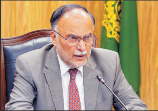
اسلام آباد، وفاقی وزیر منصوبہ بندی احسن اقبال کی زیر صدارت اجلاس جاری ہے۔