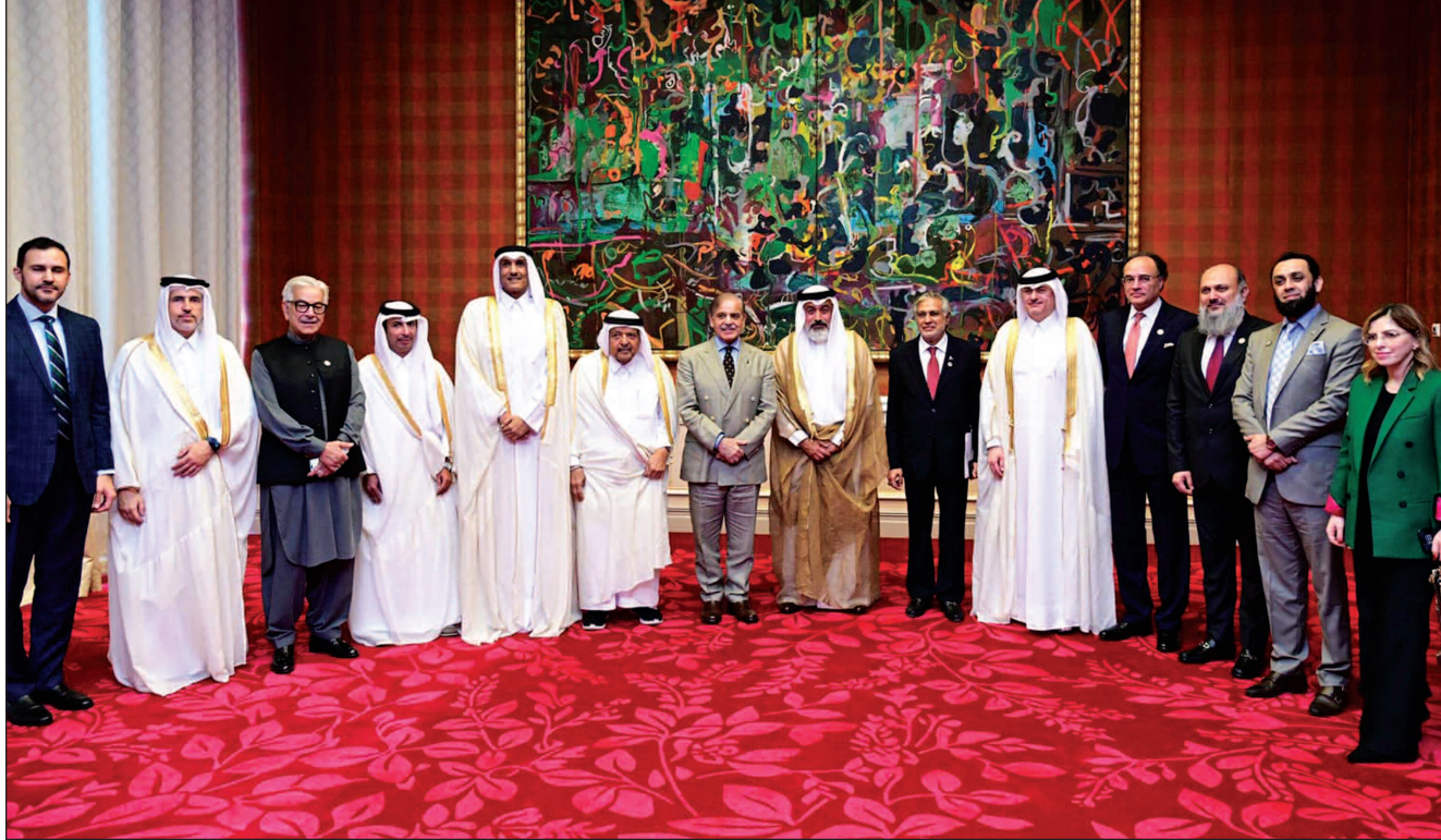
DOHA: Prime Minister Muhammad Shehbaz Sharif in a group photo with a delegation of Qatar Businessmen Association.

ISLAMABAD: Federal Minister for Maritime Affairs Qaiser Ahmed Sheikh on Friday said that foreign investors are taking keen interest in Pakistan for investment in various sectors. Prime Minister Shehbaz Sharif's visit to Saudi Arabia and Qatar, has been successful and several international companies are looking towards Pakistan for exploring business opportunities, he said while talking to PTV. Leadership of Saudi Arabia after meeting with PM Shehbaz Sharif, has decided to increase the trade volume with Pakistan, he said. In reply to a question, he said the credit goes to premier Shehbaz Sharif, for creating investment environment in this part of the region. Economic cooperation of Gulf countries with Pakistan would have positive impact over the life of the people of this country, he said.