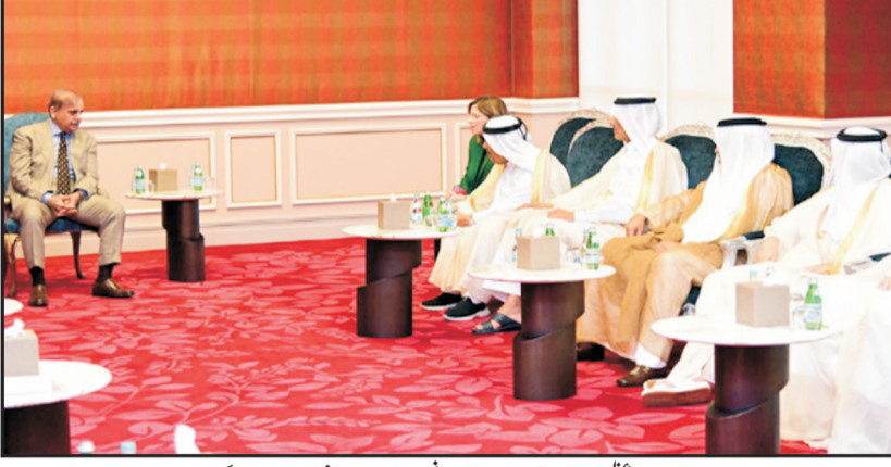
اسلام آباد، وزیر اعظم شہباز شریف سے قطر پرنس بین الدوسی الشیخ کا وفد ملاقات کر رہا ہے۔

وزیر اعظم شہباز شریف کا صدر مملکت کونون، غیر متبرک دریافت کی اسلام آباد (ذرائع کا خصوصی) وزیر اعظم شہباز شریف نے صدر مملکت آصف علی زرداری کو اپنی سربراہی کے دوران ایک بار ملاقات کرنے کا موقع فراہم کیا۔ آصف زرداری کی جلد صحت یابی کے لیے نئی نئی کوششوں کی گئی ہیں۔ وزیر اعظم شہباز شریف نے صدر مملکت آصف علی زرداری کو ملاقات کے لیے دعوت دی۔ آصف علی زرداری کی جلد صحت یابی کے لیے نئی نئی کوششوں کی گئی ہیں۔ وزیر اعظم شہباز شریف نے صدر مملکت آصف علی زرداری کو ملاقات کے لیے دعوت دی۔ آصف علی زرداری کی جلد صحت یابی کے لیے نئی نئی کوششوں کی گئی ہیں۔ وزیر اعظم شہباز شریف نے صدر مملکت آصف علی زرداری کو ملاقات کے لیے دعوت دی۔