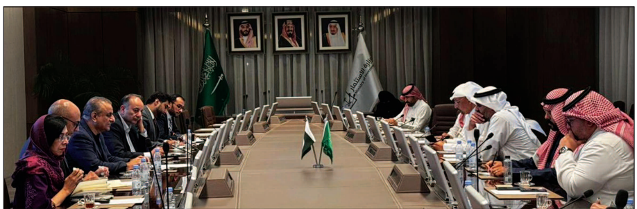
RIYAD: Pak-Saudi Minister for investment Sh Khalid Bin Abdul Aziz and Abdul Aleem Khan & Federal Minister Musadaq Malik and senior officials.

Dr. Musadik Malik further stated that some opponent had previously mocked the signing of Memorandum of Understanding (MOUs) with Saudi Arabia, suggesting it was merely a routine practice with little tangible outcome. However, he emphasized that this time would be different. "Now, people will see that these are not just MOUs on paper but actual transactions and investments materializing," Dr. Malik asserted. He highlighted that around five of the MOUs have already translated into concrete contracts and transactions, paving the way for increased employment and investment opportunities in Pakistan. Pakistan and Saudi Arabia have a long-standing "brotherly" relationship, sharing common interests, values and a shared foreign policy outlook, particularly in regional and international events, he added. DNA