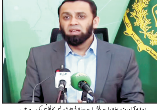
اسلام آباد، وزیر اطلاعات و شریات عدالت طاہر تارڑ پریس کانفرنس کر رہے ہیں

میتھیں نصب کرنا فیصلہ تمام ایتیز پورس پر پابندی لگائی جائے گی۔ تمام ایتیز پورس پر پابندی لگائی جائے گی۔