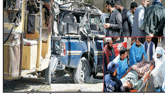
بلوچستان کے ضلع مستونگ میں دھماکہ کے بعد چینی گاڑی کا پتلا ٹکڑا دکھایا گیا ہے۔

دھماکہ سے قریبی عمارتوں کے شیشے ٹوٹ گئے، پولیس موہاں تیار، رشوں کو بھی نقصان، پولیس اہلکار ایک راکٹر اور 5 طالب علم جاں بازی ہار گئے، زخمیوں میں بڑی تعداد میں سکول کے طلبہ شامل ہیں، پولیس حکام اسلام آباد (یورپورٹ) مستونگ میں دھماکہ سے قریبی عمارتوں کے شیشے ٹوٹ گئے، پولیس موہاں تیار، رشوں کو بھی نقصان، پولیس اہلکار ایک راکٹر اور 5 طالب علم جاں بازی ہار گئے، زخمیوں میں بڑی تعداد میں سکول کے طلبہ شامل ہیں، پولیس حکام اسلام آباد (یورپورٹ) مستونگ میں دھماکہ سے قریبی عمارتوں کے شیشے ٹوٹ گئے، پولیس موہاں تیار، رشوں کو بھی نقصان، پولیس اہلکار ایک راکٹر اور 5 طالب علم جاں بازی ہار گئے، زخمیوں میں بڑی تعداد میں سکول کے طلبہ شامل ہیں، پولیس حکام