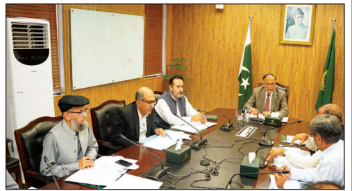
ISLAMABAD: Federal Minister for Planning, Development, Ahsan Iqbal, chaired a meeting to review the progress on the transfer of Pak Public Works Department (Pak PWD) projects to provincial governments under the Public Sector Development Programme (PSDP).

ISLAMABAD: Minister for Planning, Development, and Special Initiatives, Ahsan Iqbal Friday said that the Federal Government was committed to utilising all resources for the development of the Balochistan province. Responding to a question during the ongoing 343rd session of the Upper House, he informed that a total of 200 PSDP projects were underway in Balochistan, with an estimated cost of 1429 billion rupees. He said an amount of 130 billion rupees had been earmarked for the PSDP in 2024-25 while more allocation of funds would be ensured for the uplift of the Balochistan projects. However, he stressed the importance of improving the administrative capacity of provinces for better service delivery of funds and resources after allocations. Meanwhile, Minister for Industries and Production, Rana Tanveer Hussain replying to a question told the House that restructuring of the Utility Stores Corporation was underway to make it more viable in terms of business and its day-to-day operations. The Minister said that during the restructuring, the rights of the utility Stores' employees would be safeguarded.