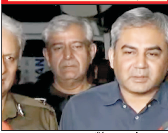
اسلام آباد، وزیر داخلہ گنڈاپور میں میڈیا سے گفتگو کر رہے ہیں

عمران خان ہمارے ریڈ لائن، ہدف سے پیچھے نہیں ہمیں گے، علی امین گنڈاپور اسلام آباد (پبلک سروس) وزیر اعلیٰ پنجاب نے کہا ہے کہ مساب کا اقتدار بانی بی بی آئی کے پاس ہے۔ عمران خان ہمارے ریڈ لائن ہیں، ہمارے ہدف سے پیچھے نہیں۔ گنڈاپور میں دینی ائین کی ترقی کے لیے کام کرنے والے لوگوں کو ہدف سے پیچھے نہیں ہٹانے دیا جائے گا۔