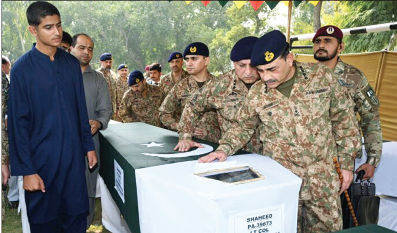
RAWALPINDI: Chief of Army Staff (COAS), General Syed Asim Munir along with senior army and civil officers, soldiers and relatives of the martyrs on Saturday offered the funeral prayers of Army martyrs.

ISLAMABAD: Federal Minister for Commerce Jam Kamal Khan on Saturday said that in the country's economy, all economic indicators were showing positive growth for sustainable economic growth. The country's exports show improvements as compared to last year, the interest rate is falling and inflation drastically gone low, he said in a statement issued by the Ministry of Commerce. He said the foreign exchange stability achieved and stock exchange performing well as compared with other global and regional markets. The upcoming visits of Azerbaijan President and Malaysian PM, Saudi Business summit and SCO summit are positive signs for local economy, he said. Jam Kamal Khan said that agitations by PTI and the role of KP chief minister was not only discouraging but also bad for the country. The foreign investment commitments and delegates are regularly coming to Pakistan, he said. Kamal said that Privatization, FBR reforms, downsizing, ease of doing business and formation of Exim Bank were the key components of Small Medium Enterprise (SME) sector for betterment and growth of national economy. The commerce minister said that historical foreign business participation in Expo fairs was a sign of the sign of their confidence in government's performance. Now the energy rate challenge will be resolved soon and will contribute to a better industrial growth, he added. APP