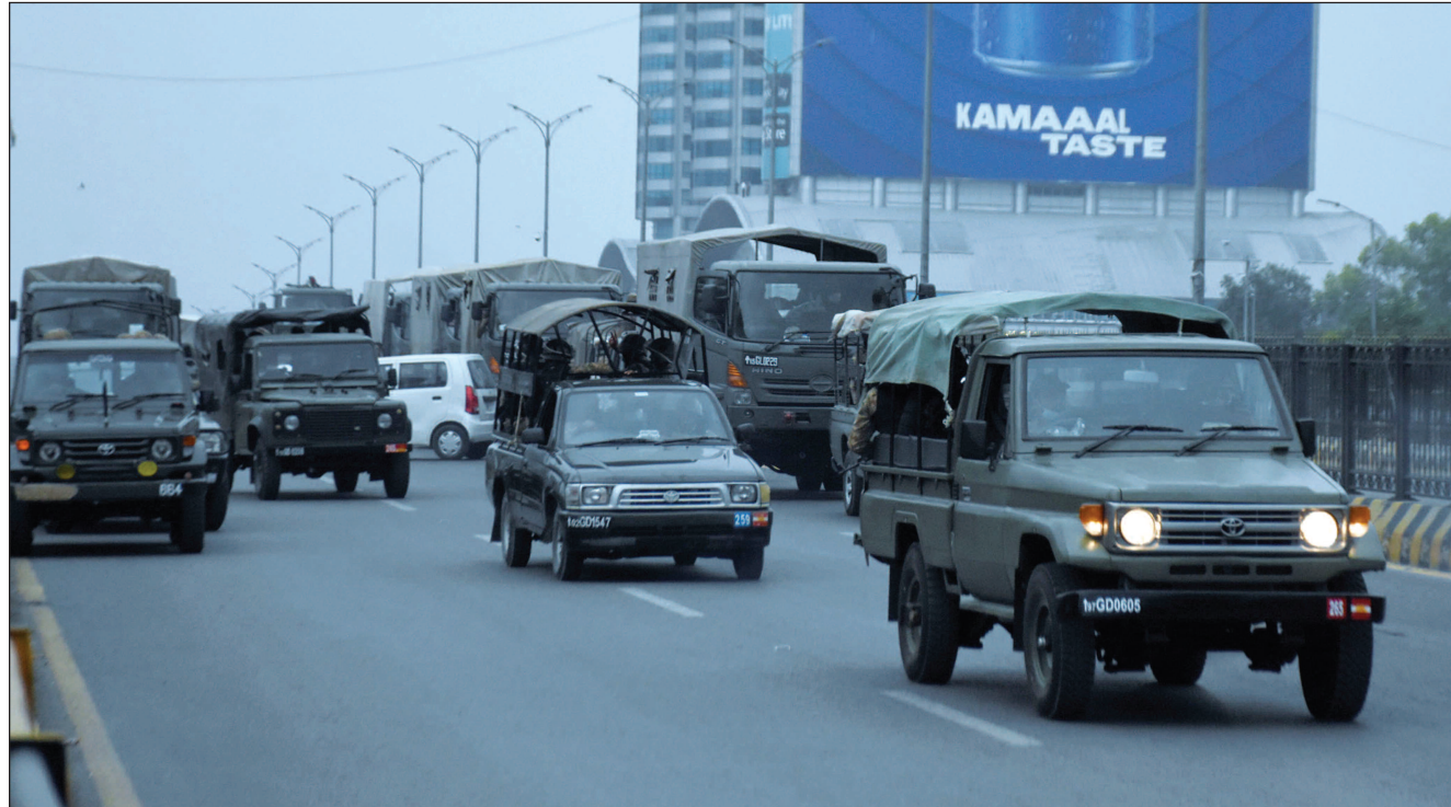
ISLAMABAD: Pakistan Army troops patrolling in the Federal Capital, ahead of the Shanghai Cooperation Organization (SCO) Summit and several high-profile visits later this month in the wake of the protest calls given by Pakistan Tehreek-e-Insaf (PTI). ONLINE

The restrictions will remain in effect from Thursday, October 3 (today), to Tuesday, October 8, to maintain law and order and protect lives and property. According to the notification, public gatherings could serve as soft targets for terrorists. The Punjab Home Department has issued the official notification for the imposition of Section 144. The move comes ahead of Pakistan Tehreek-e-Insaf's (PTI) planned protest in Lahore today.