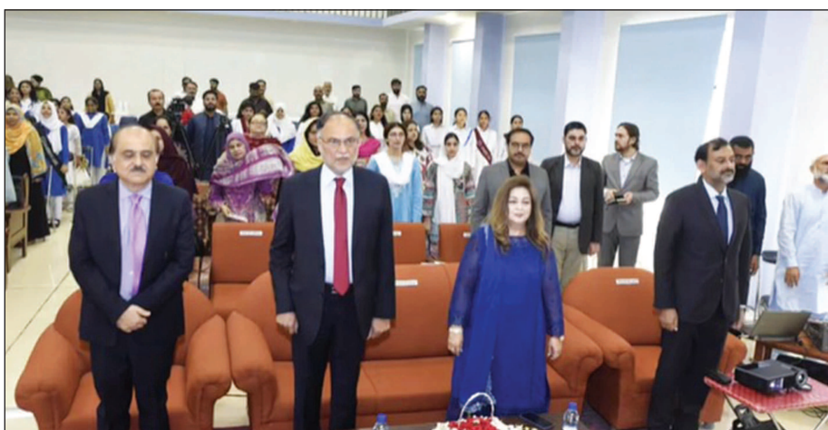
ISLAMABAD: Federal Minister for Planning, Development and Reforms, Ahsan Iqbal here on Saturday paid rich tributes to teachers on 'World Teachers' Day', saying they were the builders of nation. (Story on Page 1)

The revised examination schedule will be announced at a later date," she stated, adding that the Commission regrets any inconvenience caused by the postponement and appreciates candidates' cooperation. APP