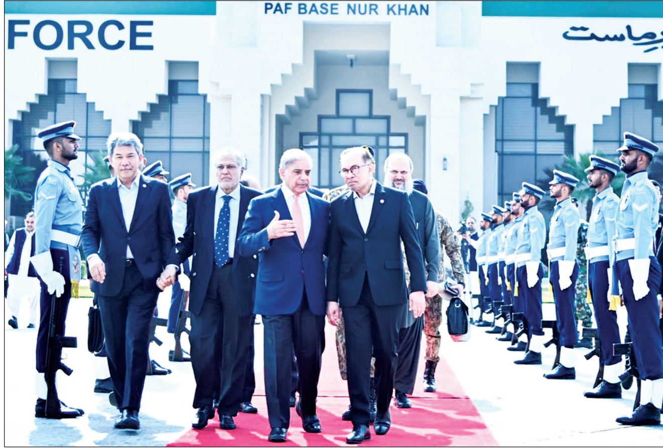
RAWALPINDI: Prime Minister Muhammad Shehbaz Sharif bidding farewell to Prime Minister of Malaysia Dato' Seri Anwar Ibrahim at Nur Khan Air Base.