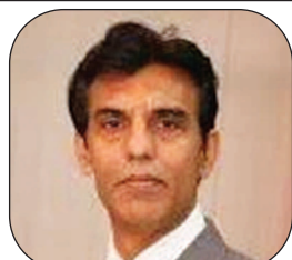
Dr. Abid Qaiyum Suleri

The writer teaches at the University of Malakand. He can be reached at: muradali.oom@gmail.com