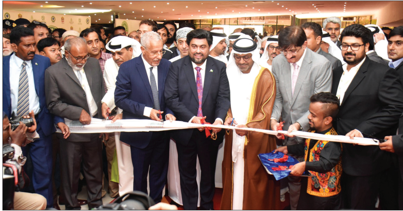
KARACHI: Governor Sindh Kamran Tessori & Chief Minister Sindh Syed Murad Ali Shah along with Foreign delegates Inauguration the Pakistan First 2 days International Date Palm Festival In collaboration with Khalifa International Awards (UAE) has been organized by Ministry of National Food Security.

Speaking on the occasion, Nawaz Sharif said, Pakistan and Australia's partnership is very important. He said business-friendly environment was being provided in Pakistan to facilitate investment activities. The Australian High Commissioner said efforts were being made to further promote ties with Pakistan.