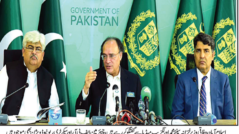
اسلام آباد، وفاقی وزیر خزانہ شیخ رشید احمد اور نئے سربراہ آئی ایس آئی آئی ایف بی آئی کے سربراہ ریزی ریڈیو ٹی وی میں موجود ہیں

آئی ایس آئی کے نئے سربراہ آج اپنی ذمہ داریاں سنبھالیں گے اسلام آباد (خلاف رپورٹ) قومی سلامتی کے ادارے آئی ایس آئی کے نئے سربراہ لیفٹیننٹ جنرل عامر ملک آج بروز جمعرات اپنی ذمہ داریاں سنبھالیں گے۔ لیفٹیننٹ جنرل عامر ملک اس سے پہلے لیفٹیننٹ جنرل کے طور پر فرائض انجام دے رہے تھے وہ لیفٹیننٹ جنرل نسیم احمد کو جگہ لیں گے جو اپنے عہدے سے سبکدوش ہو گئے ہیں۔ اس حوالے سے تہ تیہ کی گئی آئی ایس آئی ہیڈ کوارٹرز میں وہ جہاں جنرل عامر ملک باضابطہ طور پر اپنی ذمہ داریاں سنبھالیں گے تعینات کیا تھا۔