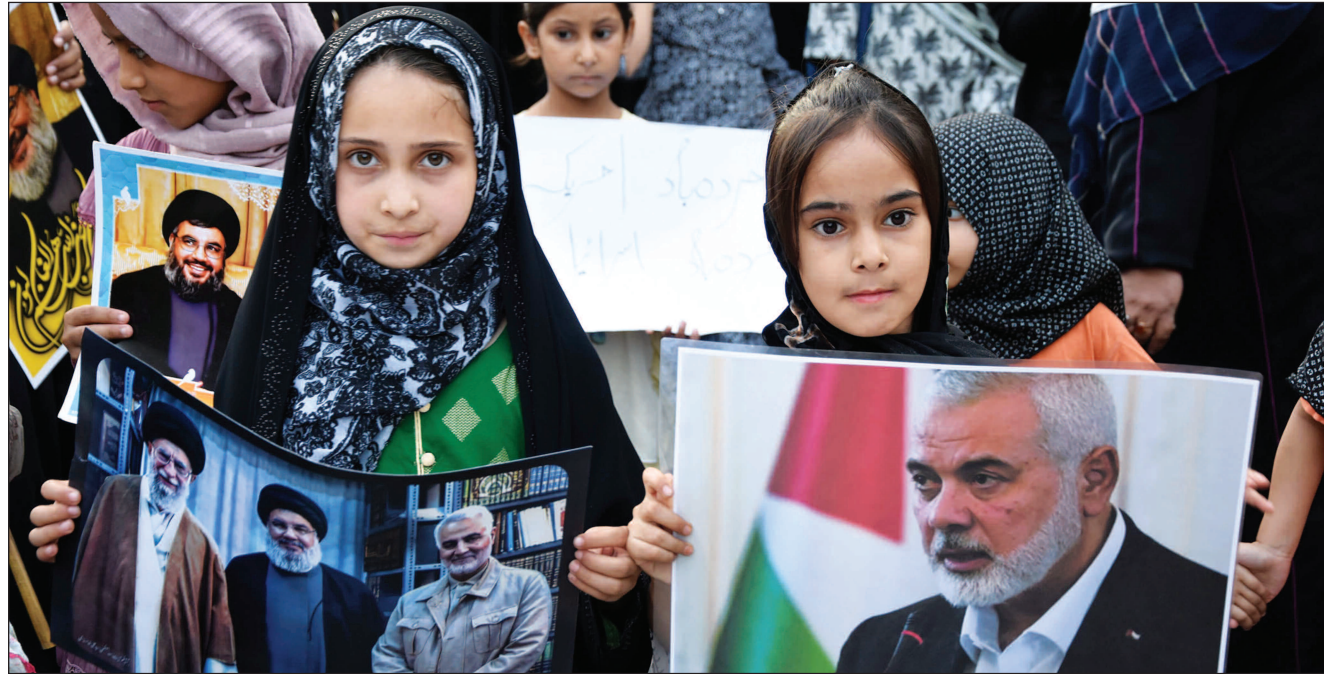
ISLAMABAD: Activists of Majlis Wahdat-e-Muslimeen carrying placards and Palestinian national flags stand beside a portrait of slain Lebanese Hezbollah chief Hassan Nasrallah, during an anti-Israel protest in the Federal Capital. Hezbollah chief Hassan Nasrallah has been killed, the Lebanese movement said on September 28, dealing a seismic blow to the Iran-backed group that has been engaged in a year of cross-border hostilities with Israel.

top priority of the Government and targeted action would be taken whenever terrorists were found in the country. Engr Amir Muqam said that he had also survived life attempts and continued raised voice for peace in the country including Swat. He asked CM KP to compete with Chief Minister Punjab Maryam Nawaz Sharif in terms of good governance and people service. Engr Amir Muqam said that PTI workers are being misled on hallo slogans again and advised them to take distance of CM agitation politics. He said that roads infrastructure in Swat were deteriorated due to poor policies of PTI Government, marring tourism, trade and development. Engr Amir Muqam congratulated Prime Minister Muhammad Shehbaz Sharif for his successful visit of the UNGA. He said that Prime Minister Muhammad Shehbaz Sharif has won hearts and minds of Pakistanis, Kashmiris and Palestinians for successful highlighting Kashmir and Palestine issues at UNGA. APP