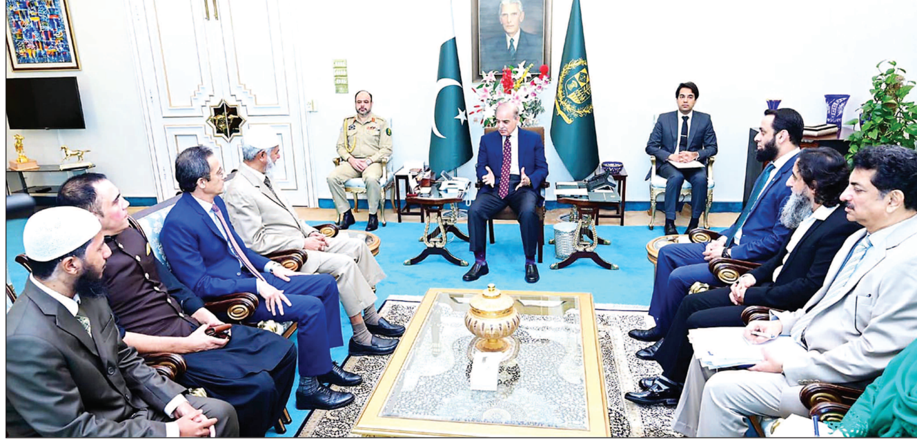
ISLAMABAD: Renowned Islamic Scholar Dr. Zakir Naik calls on Prime Minister Muhammad Shehbaz Sharif.