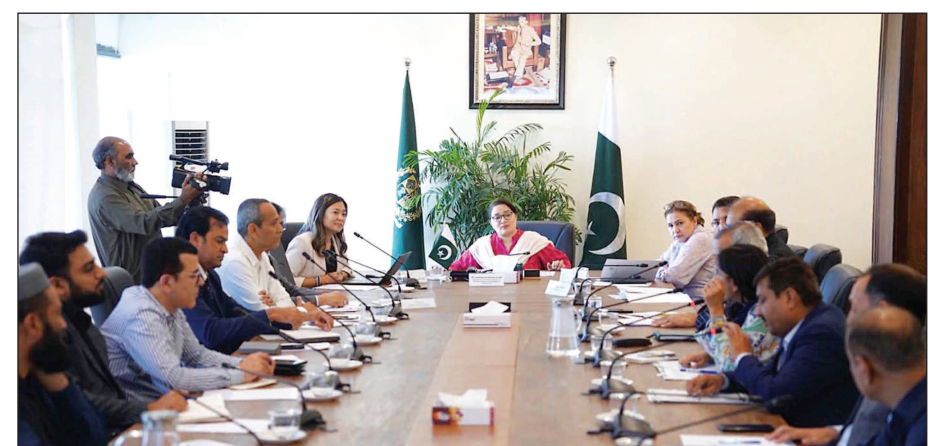
ISLAMABAD: Coordinator to Prime Minister on Climate Change Romina Khurshid Alam chairs a high-level meeting on the Country Programme Framework 2024-28 with the Global Green Growth Initiative in the M/o Climate Change & Environmental Coordination.

She said, "the Punjab government will give loans to the land owners of one to five marlas in the city, one to ten marlas in the villages. We worked day and night to fulfill the dream "Apni Chhat Apna Ghar" program. The conditions for obtaining a loan were strict, after abolishing all such conditions, we asked the people to obtain a loan by showing the identity card and ownership papers. We would give a loan of one lakh in a year through transparent balloting. I strictly directed that loan installment of Apna Ghar program should not be more than Rs.14 thousand. There is zero interest on getting a loan under "Apni Chhat Apna Ghar" program and not single penny of interest will need to be paid.