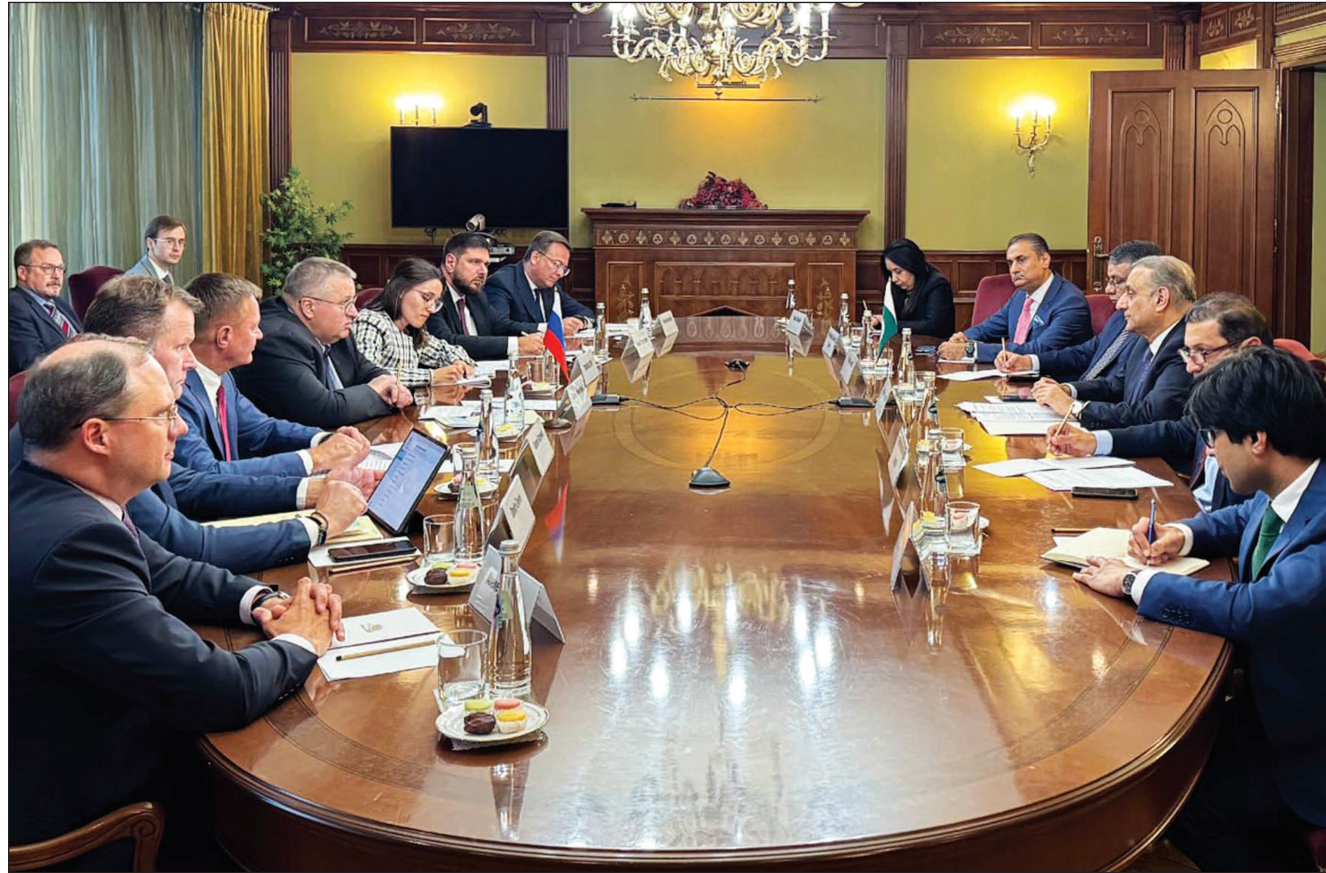
MOSCOW: Federal Minister for Board of Investment, Privatization & Communications Abdul Aleem Khan in a meeting with Deputy Prime Minister Russian Federation Mr. Alexy Overchuk.

The court accepted the request of Barrister Ali Zafar regarding his meeting with the PTI founder and instructed the AGP to make arrangements on the same day. APP