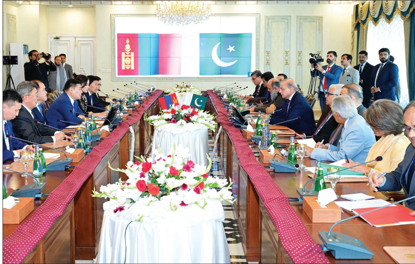
ISLAMABAD: The Prime Minister of Mongolia H. E. Luvsannamsrain Oyun-Erdene along with a delegation meets Prime Minister Muhammad Shehbaz Sharif.

He said that not only passports but also NADRA data computability were being appropriately checked. The Federal Investigation Agency (FIA) is taking up proper investigations into the matters pertaining to issuance of CNICs to non-Pakistanis where if the movers have any information against private rackets it should be shared to the relevant forum for proper action, the Minister said. "Verification steps have been increased and every document is meticulously verified. The applicant has to provide proper proofs of residence. NADRA has one of the most technologically verified databases. Many departments are using NADRA data for face-verification and other data confirmations," Tarar said. The Speaker National Assembly pointed out that some NADRA officials were previously arrested for lapses and hoped that no such issue would recur. Speaker Ayaz Sadiq directed MNA Noor Alam to provide him the lists of the suspected individuals that would be shared with the Interior Ministry. APP