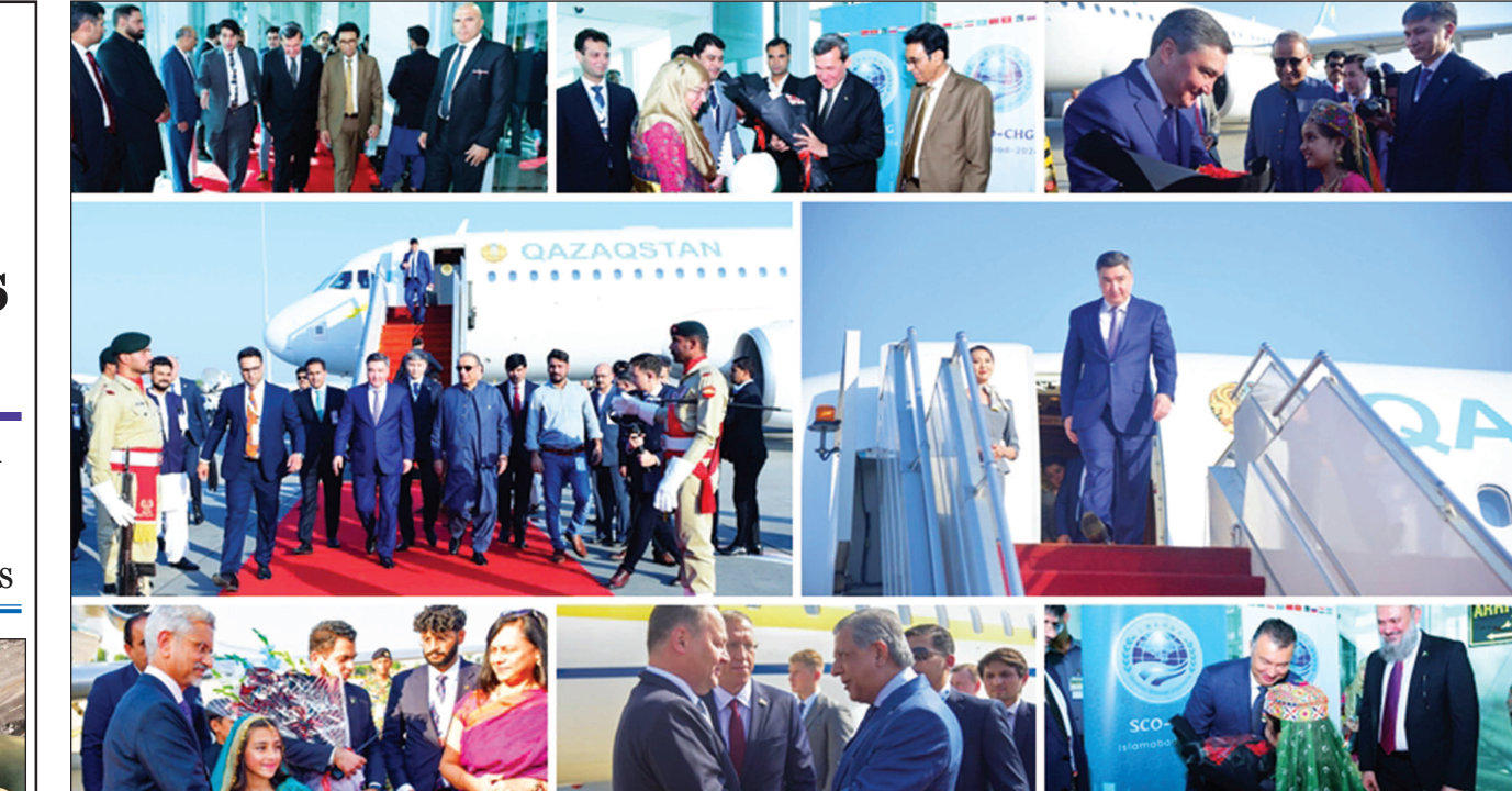
ISLAMABAD: The leadership of the member states of Shanghai Cooperation Organization has arrived in Islamabad to attend 23rd SCO Council of Heads of Government meeting.

ISLAMABAD: Prime Minister of Tajikistan, Kohir Rasulzoda arrived here on Tuesday to attend the twenty-third meeting of the Council of Heads of Government (CHG) of the Shanghai Cooperation Organization (SCO). Federal Minister for Commerce Jam Kamal Khan warmly received the distinguished guest at Islamabad International Airport. Children dressed in traditional attire presented bouquets of flowers to the foreign dignitaries. A red carpet was rolled out to welcome the guests, underscoring the importance of the event and the cordial relations between the two nations. The two-day meeting of SCO CHG, the second highest forum within the SCO, will be chaired by Prime Minister Shehbaz Sharif as the current chair of the Council. Pakistan had assumed the rotating chair of the SCO CHG for 2023-24 at the previous meeting held in Bishkek on October 26, 2023 where the country was represented by then interim Foreign Minister Jalil Abbas Jilani.