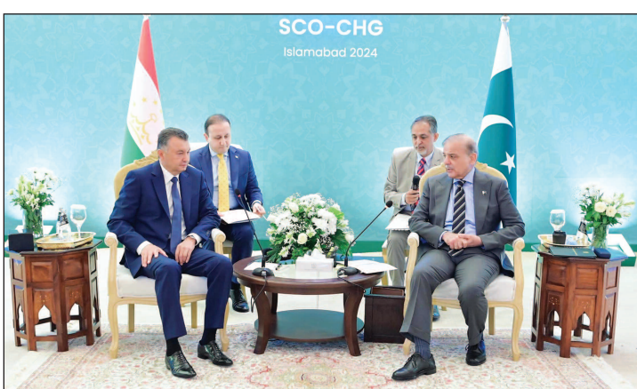
ISLAMABAD: Prime Minister Shehbaz Sharif held a bilateral meeting with his Tajikistan counterpart Kohir Rasulzoda in Islamabad on

Tuesday on the sidelines of the SCO Council of Heads of Government Meeting. While deeply appreciating Tajikistan's active and constructive participation in the SCO meeting, Shehbaz Sharif stressed that as brotherly countries and regional partners, Tajikistan and Pakistan share enduring bonds of friendship and cooperation. He fondly recalled his productive visit to Dushanbe in July this year, and expressed satisfaction over the positive trajectory of the bilateral relationship. He underscored that both countries should continue to collaborate closely and further cement the mutually advantageous cooperation across all spheres of shared interest, particularly in the