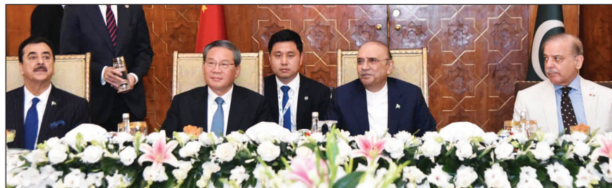
ISLAMABAD: President Asif Ali Zardari hosted a state luncheon in honour of the Premier of the State Council of People's Republic of China, Li Qiang, at Aiwan-e-Sadr, on 15-10-2024. Prime Minister Muhammad Shehbaz Sharif and Chairman Senate, Syed Yousuf Raza Gillani, are also present.

ISLAMABAD: Pakistan and China have reaffirmed their commitment to further deepen strategic cooperation across key areas, including the economy, investment and regional connectivity. This was discussed during a meeting between President Asif Ali Zardari and the visiting Chinese Premier Li Qiang in Islamabad on Tuesday. Both sides also emphasized the need to expedite the implementation of China-Pakistan Economic Corridor projects. Welcoming the delegation, the President emphasized that Pakistan's friendship with its all-weather partner remains a cornerstone of the country's foreign policy. He stressed the importance of exploring new avenues for cooperation as there is more space to expand bilateral relations. He also underscored the need to enhance connectivity through all-weather road networks to strengthen trade and people-to-people linkages. He said Chinese companies should benefit from the investment opportunities in Pakistan by investing in the Pakistan Stock Exchange. Asif Ali Zardari said the time is ripe to fully leverage China's economic growth, particularly through the opportunities presented by CPEC and the Gwadar Port. He said he will be visiting China in November and looks forward to reconnecting with old friends and engaging in discussions to further strengthen bilateral ties. Reflecting on his previous visits to China during his earlier tenure, he noted Pakistan has consistently enjoyed China's unwavering support on key issues of mutual