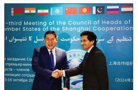
ISLAMABAD: Mongolian Prime Minister Oyun-Erdene Luvsannamsrai arrived on Tuesday to participate in the twenty-third meeting of the Council of Heads of Government (CHG) of the Shanghai Cooperation Organization (SCO). State Minister for Finance and Revenue Ali Pervaiz Malik warmly welcomed the distinguished guest.