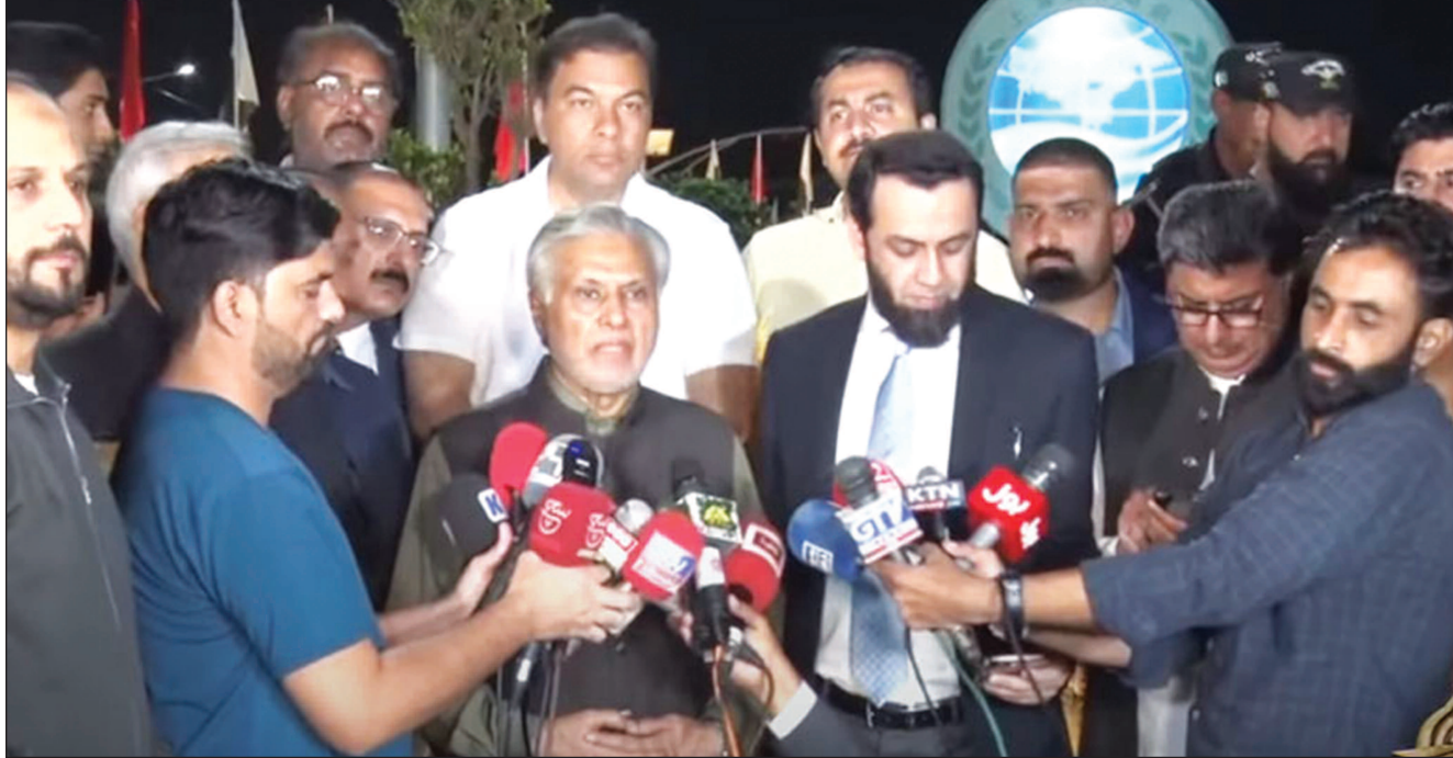
ISLAMABAD: Deputy Prime Minister and Foreign Minister Ishaq Dar says Pakistan is all set to host twenty-third meeting of Council of the Heads of Government of the Member States of the Shanghai Cooperation Organization.

This visit will provide an opportunity to both the sides to reaffirm their mutual support on core issues, advance the high-quality development of CPEC, and strengthen regular exchanges on important regional and global developments. SABAH