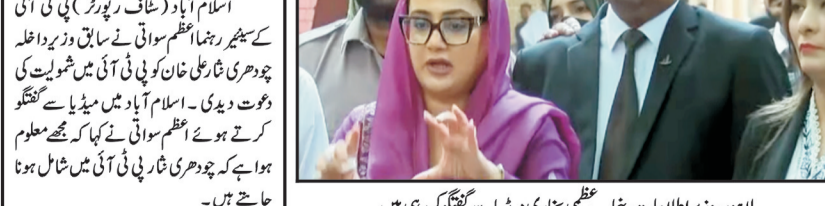
آئی میں شہادت کی دعوت