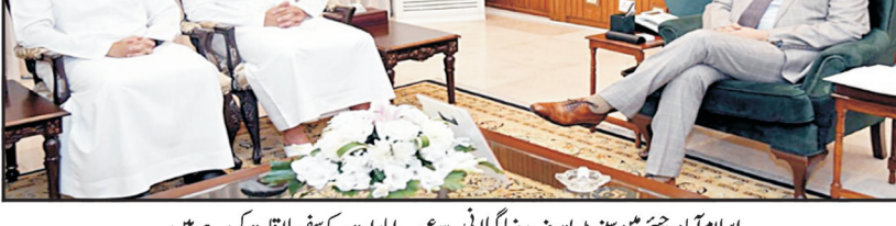
اسلام آباد، چیئر مین بینٹ یوسف رضایا کیلئے عرب امارات کے سفیر ملاقات کر رہے ہیں