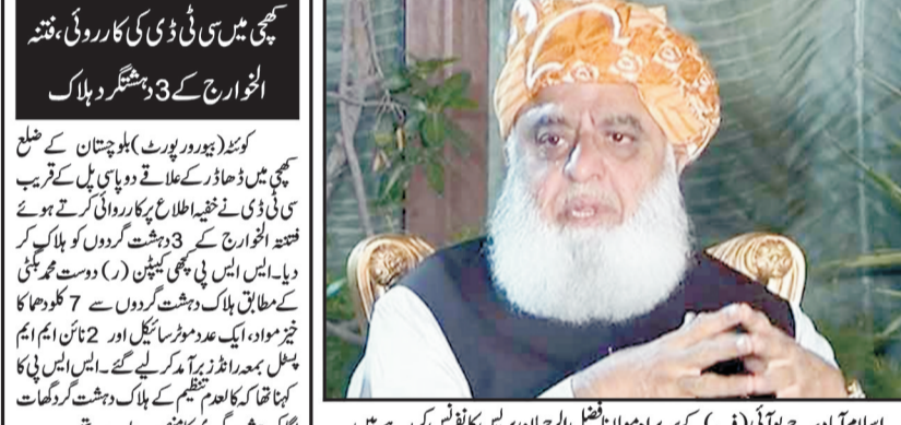
اسلام آباد، پیر (ف) کے سربراہ مولانا فضل الرحمان پریس کانفرنس کر رہے ہیں

کوئٹہ (بیورو رپورٹ) بلوچستان کے ضلع گجی میں خاؤد کے علاقے دویا میں کیڑا کی پی ٹی آئی کے خلاف کارروائی ہوئی، 3 ملزمان کو گرفتار کیا گیا۔