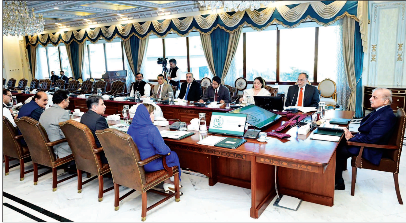
ISLAMABAD: Prime Minister Muhammad Shehbaz Sharif chairs a meeting on matters related to Ministry of Federal Education and Professional Training.

He also revealed that Maulana Fazlur Rehman has been invited to share his suggestions on the matter.