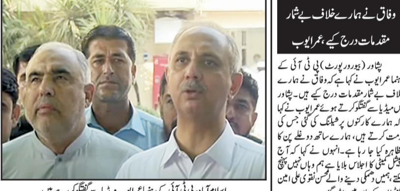
اسلام آباد، پی ٹی آئی کے رہنما عرابیہ میڈیا سے گفتگو کر رہے ہیں۔

ساعت سے پی ٹی آئی کے وکلاء غائب ہونے پر چیف جسٹس برہم، مزید التواء دینے سے انکار، انہیں ہڈی لائن چاہیے لیکن سپریم کورٹ ایسی کوئی ہڈی لائن نہیں دے گی، ریمارکس اسلام آباد (پبلشر رپورٹر) چیف جسٹس قاضی فاضل عباسی نے اپنی فیصلہ میں کہا کہ پی ٹی آئی کے وکلاء کو ساعت سے غیر حاضر ہونے پر مزید التواء دینے سے انکار کر دیا اور کہا کہ تاخیری حربے استعمال کرنے پر ہمیں ہڈی لائن چاہیے لیکن سپریم کورٹ ایسی کوئی ہڈی لائن نہیں دے گی۔