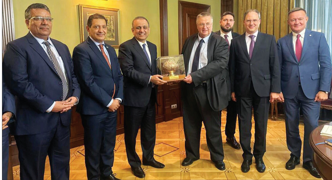
MOSCOW: Federal Minister Abdul Aleem Khan meets Russian Deputy Prime Minister Alexey Overchuk in Moscow to discuss trade relations and infrastructure projects.

Additionally, the CDA is developing an extensive bicycle route network to promote sustainable commuting options throughout the city, the chairman informed the meeting. APP