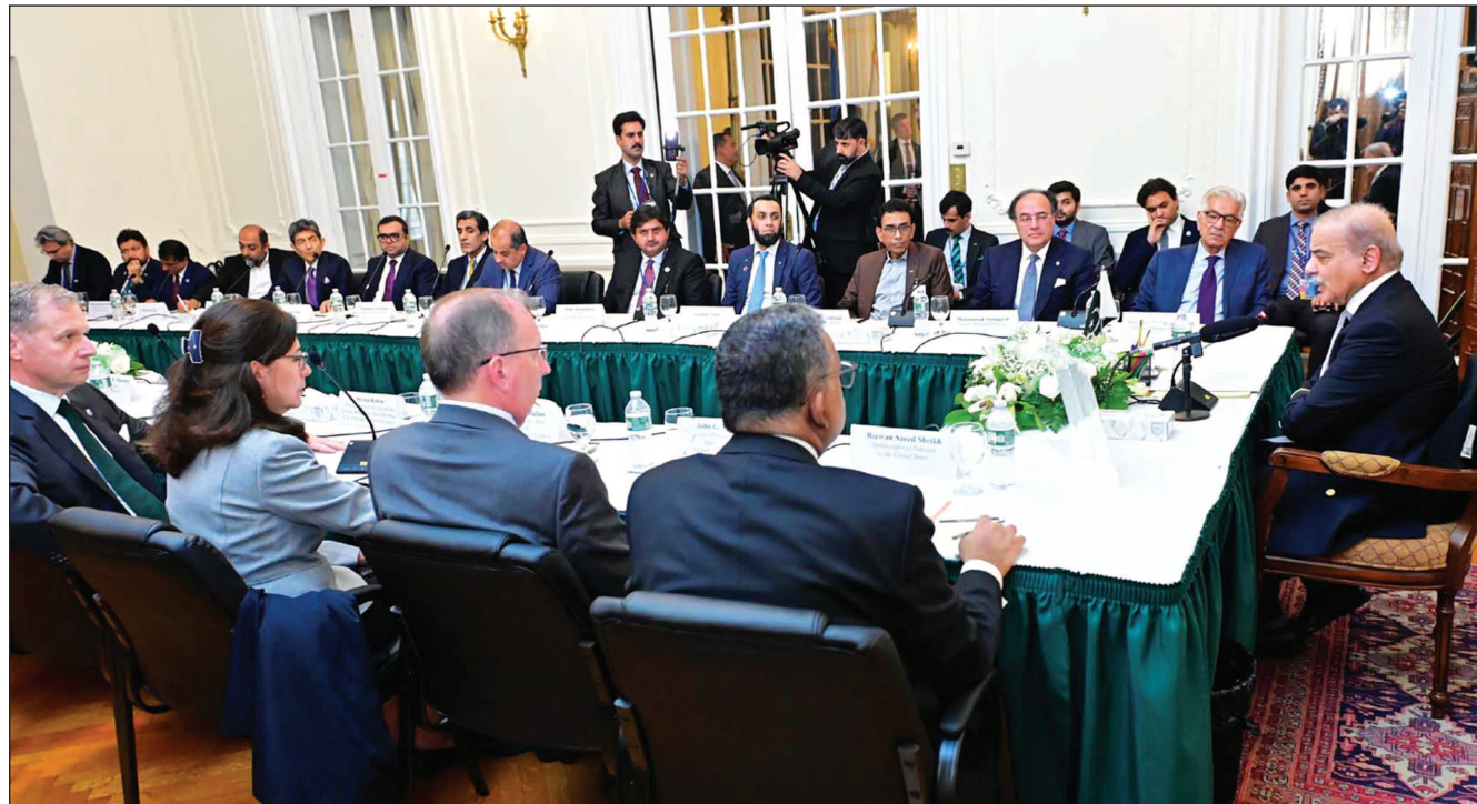
New York: Prime Minister Muhammad Shehbaz Sharif meets with a delegation of the US-Pakistan Business Council on the sidelines of 79th session of the United Nations General Assembly.

COAS highlighted that Pakistan has remarkable potential in various domains and all must have unflinching trust and confidence in the bright future of Pakistan. Given the immense resources and potential, Pakistan is destined to achieve its rightful position in the comity of nations, Insha Allah. Earlier on arrival, COAS was received by Corps Commander Karachi. SABAH