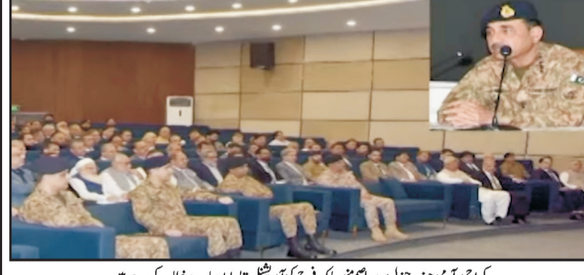
کراچی، آری جیل جنرل سید عاصم منیر کی فوج کی آپریشنل تیاریوں بارے خطاب کر رہے ہیں

ریملک کوتاہ کر رہے ہیں، قوم کو پاکستان کیلئے نکلنا پڑیگا، بانی پی پی آئی ریملک کوتاہ کر رہے ہیں، قوم کو پاکستان کیلئے نکلنا پڑیگا، بانی پی پی آئی ریملک کوتاہ کر رہے ہیں، قوم کو پاکستان کیلئے نکلنا پڑیگا، بانی پی پی آئی