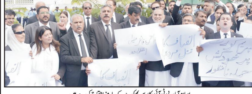
اسلام آباد، پی پی آئی کی آئی ڈی کے خلاف احتجاج کر رہے ہیں