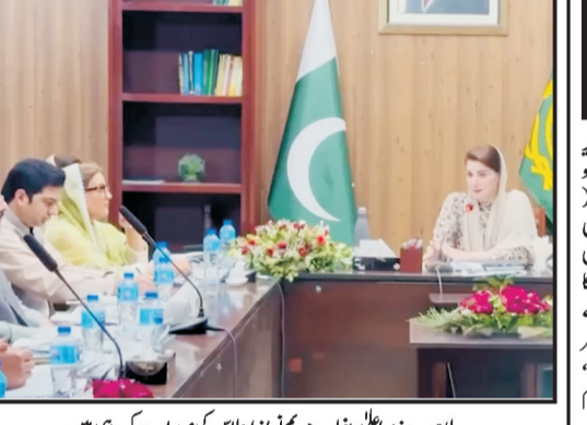
لاہور، وزیر اعلیٰ پنجاب مریم نواز اجلاس کی صدارت کر رہی ہیں

چائے، اقتصادی ترقی کیلئے نوجوانوں کو آئی ٹی کی جانب لانا ہوگا چائے، اقتصادی ترقی کیلئے نوجوانوں کو آئی ٹی کی جانب لانا ہوگا چائے، اقتصادی ترقی کیلئے نوجوانوں کو آئی ٹی کی جانب لانا ہوگا