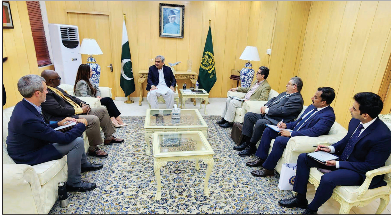
ISLAMABAD: Federal Minister for Interior Mohsin Naqvi in a meeting with the delegation of US Bureau of International Narcotics and Law Enforcement Affairs (INL).

He emphasized that Balochistan's beautiful beaches and deserts, coupled with religious heritage sites, could attract more tourists with better collaboration between the federal and provincial governments. APP