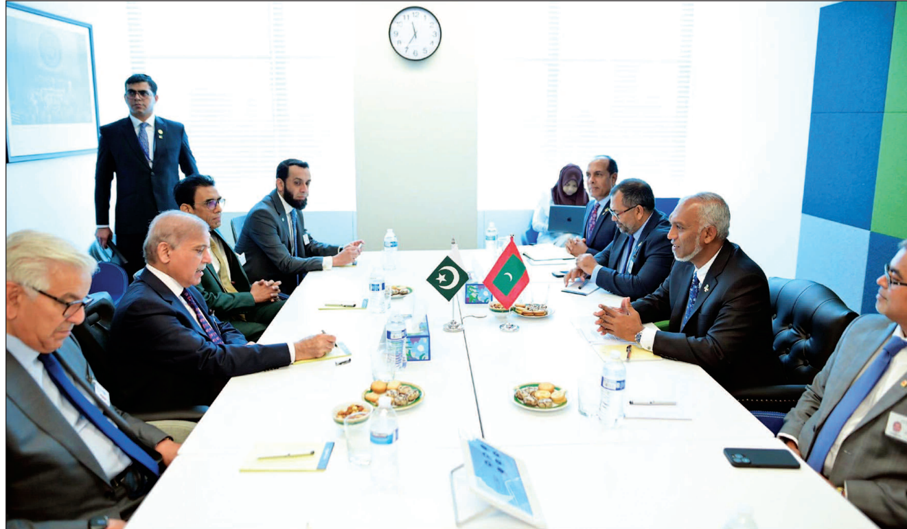
NEW YORK: Prime Minister Muhammad Shehbaz Sharif meets President of Maldives Dr. Mohamed Muizzu on the Sidelines of 79th Session of United Nations General Assembly.