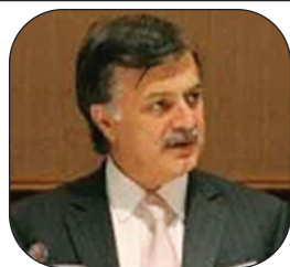
Humayun Akhtar Khan