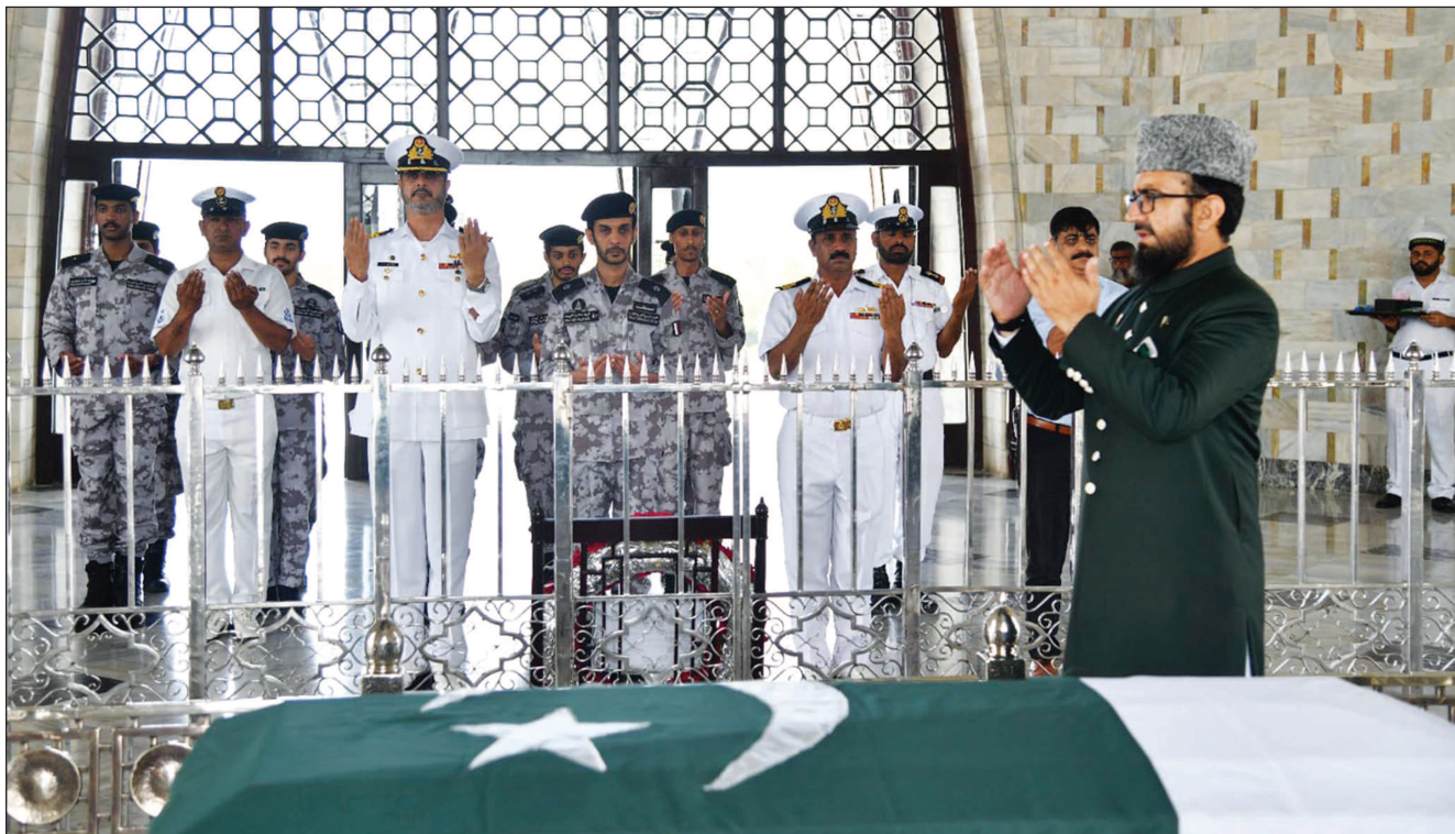
KARACHI: Qatar Emiri Naval Forces delegation offering Fatiha at Mazar-e-Quaid.

After PTI's failed Lahore show, he claimed that the Chief Minister KP has intentionally delayed the convoy to the event, predicting similar outcomes for the upcoming planned shows of PTI in Mianwali and Rawalpindi. Engr Amir Muqam praised the people of Lahore for distancing themselves from divisive, agitation and hollow slogans politics of PTI, indicating that the poor turnout at Lahore's gathering strongly reflected growing discontent of masses with PTI leadership due to their long stubbornness and rhetoric approach. DNA