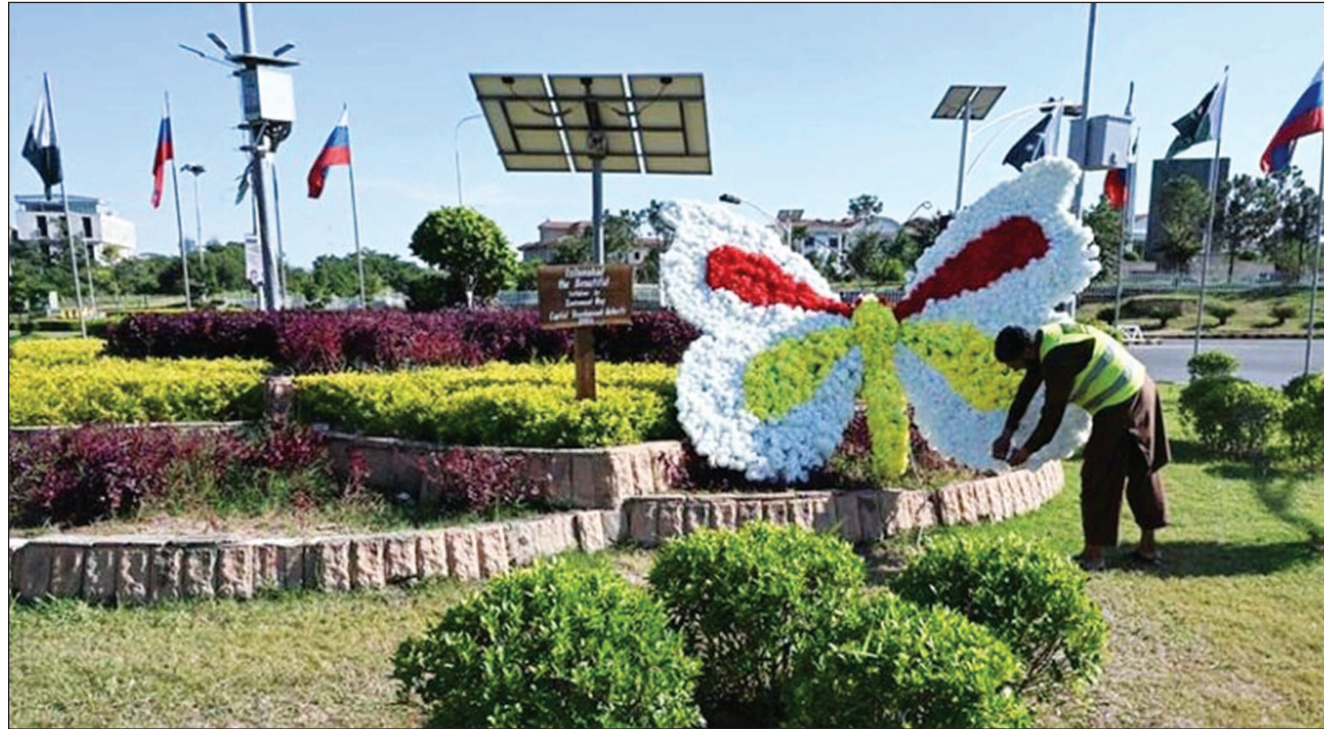
ISLAMABAD: CDA worker installs a model of floral butterfly at D Chowk enhancing the beauty of the federal capital.

On the occasion, over 50 pharmaceutical companies will be given awards for showing excellence in drug production in Pakistan. Senate Chairman, Makhdoom Syed Yousuf Raza Gilani, will be the chief guest of the award session of the summit. SABAH