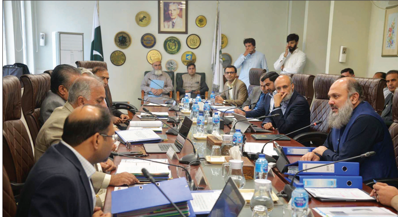
ISLAMABAD: Commerce Minister Jam Kamal Khan chairs the 85th EDF Board meeting, approving Rs. 8.5 billion for initiatives aimed at boosting Pakistan's textile, agriculture, and global branding efforts.

The projects included various marketing interventions such as holding of international level exhibitions inside Pakistan such as Texpo 2025 by TDAP, IDEAS by DEPO, Gems & Jewelry Show by FPCCI, OIC-Conference and WEXNET targeting Women empowerment by Trade Development Authority of Pakistan (TDAP). These exhibitions will not only support Pakistani exporters to exhibit their products but will be used as branding activities for Pakistan across the globe. The project funding includes facilitation to international buyers through provision of best hospitality and arrangement of B2B meetings for best match-making. The Board also approved projects linked to research & development and technology acquisition which included opening of UNIDO assisted International Technology Promotion Offices at TUSDEC, Disease Diagnostic Research Centre for Mango at Sindh Agriculture University, Tando Jam, Design Centre at Pakistan Institute of Fashion Design, Lahore as well as establishment of Solar Tunnel Dryer for Exportable Dried Chillies at Umer Kot, Mirpur Khas and Badin.