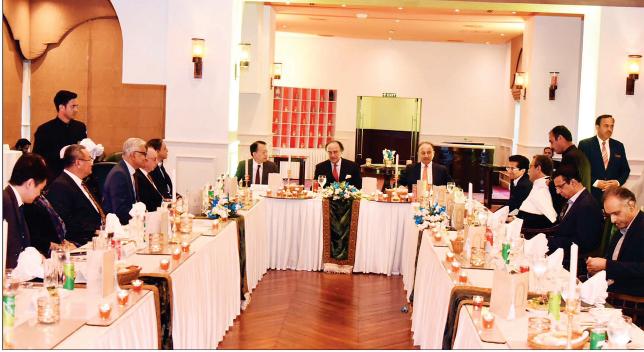
ISLAMABAD: Federal Minister for Finance and Revenue Senator Muhammad Aurangzeb hosted a dinner in honor of Mr. Masatsugu Asakawa, President of the Asian Development Bank (ADB), and his delegation.

Either the money bill will be laid down in parliament or a presidential ordinance will be promulgated but the final decision will be taken by the government after consulting with its political allies, especially the Pakistan Peoples Party (PPP).