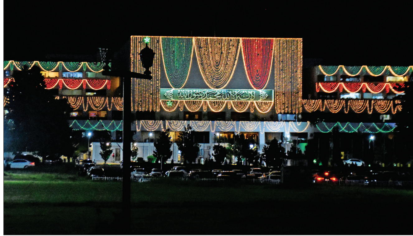
ISLAMABAD: A view of lightings in connection with Eid Milad un Nabi SAW, in the Federal Capital.