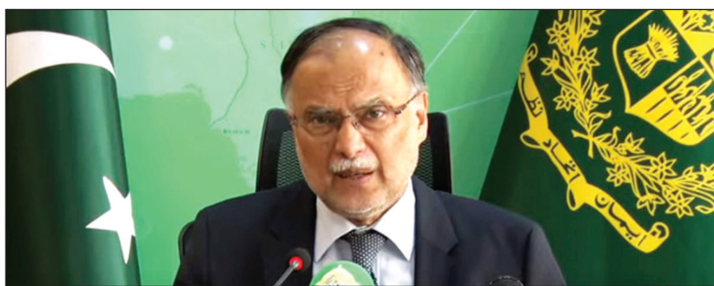
willingness for the second phase of CPEC. He said China has given assurance for the establishment of five new corridors including that of growth,

livelihood, innovation, green economy and open regional inclusive development.