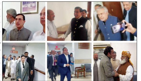
A meeting of Muttahida Qaumi Movement Parliamentary Party was also held with MQM leader Maqbool Siddiqui in the chair. It discussed different aspects related to constitutional matters. A delegation of Pakistan Tehreek-e-Insaf also visited Maulana Fazlur Rehman's residence. It is pertinent to mention that sessions of both Houses of the Parliament were also scheduled tonight. The government has intended to table the constitutional package in the parliament to strengthen the judicial system of the country.