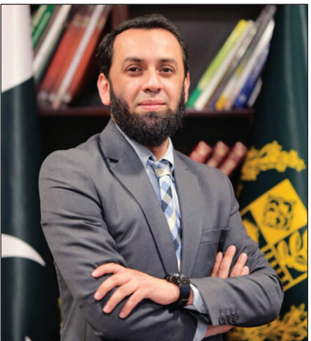
ISLAMABAD: Minister for Information, Broadcasting, National Heritage and Culture Attallah Tarar on Sunday ruled out any "person specific" legislation, reiterating the govern-

ment's commitment to ensure speedy justice for the people of Pakistan.