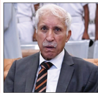
Federal Minister for Maritime Affairs Qaiser Ahmed Sheikh has said that Federal Government has approved modernization project of ship breaking industry at a cost of 12 billion rupees. During his visit in Gaddani in Hub district, the Minister said a waste management plant, a 30-bedded hospital, blacktop roads and a fire brigade station are included in the project. Qaiser Ahmed Sheikh said the process of modernization of ship breaking yard under Hong Kong Convention would be completed by June next year. He also laid foundation stone of Industrial Waste Management plant site. The Minister was briefed about operational industrial activities of Gaddani ship breaking yard.