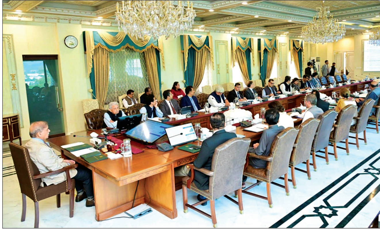
ISLAMABAD: Prime Minister Muhammad Shehbaz Sharif chairs a meeting on the use of Electric Vehicles.