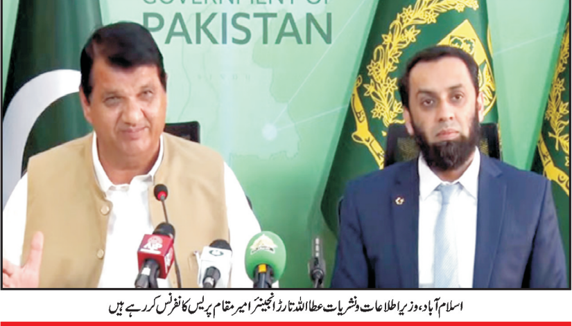
اسلام آباد، وزیر اطلاعات و شرعیات عطا اللہ تارڑ انجینئر امیر مقام پریس کانفرنس کر رہے ہیں