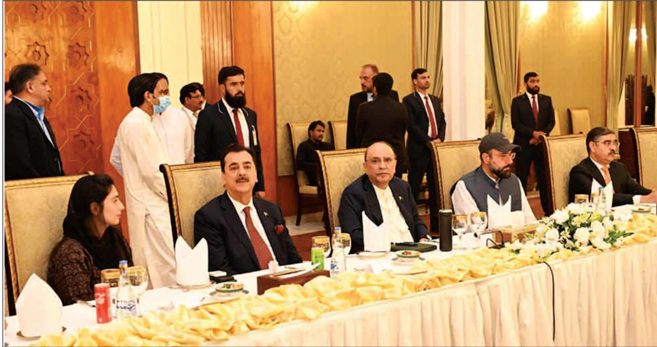
President Asif Ali Zardari hosted a dinner in honour of Parliamentarians belonging to Pakistan People's Party Parliamentarians (PPPP), Awami National Party (ANP), Pakistan Muslim League-Q (PMLQ), and Istehkaam-e-Pakistan Party (IPP), at Aiwan-e-Sadr. (Story on page 4)

The project also focus on restoring essential services by rehabilitating damaged community infrastructure and facilities, including water supply, irrigation, roads, and other community amenities.