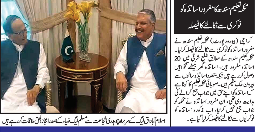
اسلام آباد، پی ایف کے سربراہ چوہدری شجاعت سے مسلم لیگ ق کے صدر ابراہیم خان ملاقات کر رہے ہیں

علی امین گنڈاپور نے ناکام جلسے کا غصہ مریم نواز، پاک فوج پر نکالا، وفاقی وزراء کو نشانہ بنایا۔ انہوں نے کہا کہ وہ پاکستان کے خلاف بے نقاب گفتگو کر رہے ہیں۔ انہوں نے کہا کہ وہ پاکستان کے خلاف بے نقاب گفتگو کر رہے ہیں۔ انہوں نے کہا کہ وہ پاکستان کے خلاف بے نقاب گفتگو کر رہے ہیں۔