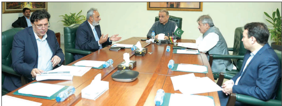
Federal Minister for Communications, Privatization & Board of Investment Abdul Aleem Khan presided over high level meeting on NHA.

The PML-N leader claimed that Khyber Pakhtunkhwa Chief Minister Ali Amin Gandapur only knew to play gimmicks and overplay serious issues, and condemned him for using derogatory language in his speech at the Sangjani meeting. He alleged the KP government of utilizing public money and machinery for the PTI meeting instead of using the same for the uplift of the deprived people of province. The PTI leaders would have to face the consequences for violation of the law, he added. Talal Chaudhry said that the government would not allow anyone to create chaos and hurl threats to the national institutions in the name of so-called peaceful protest.