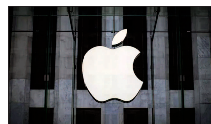
CUPERTINO: Apple on Monday unveiled its artificial intelligence-boosted iPhone 16, showing off the long-awaited phone.

"The next generation of iPhone has been designed for Apple Intelligence from the ground up. It marks the beginning of an exciting new era," Chief Executive Tim Cook said at a product launch.