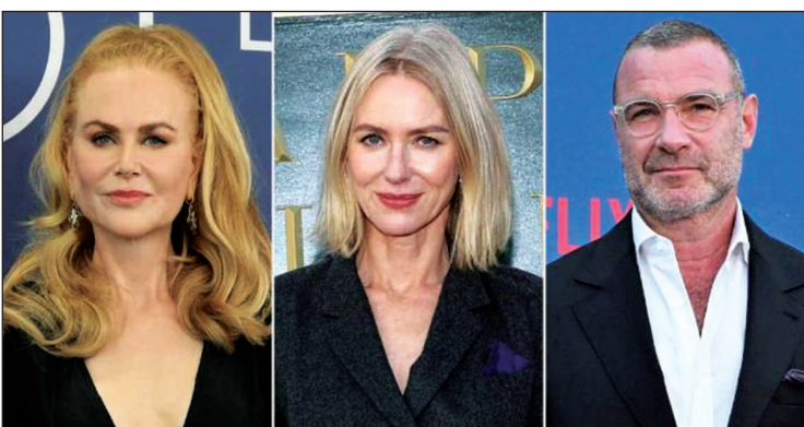
Nicole Kidman has recently made shocking revelation about her friend Naomi Watts.

Nicole Kidman is featured opposite Liev Schreiber's in new Netflix limited series