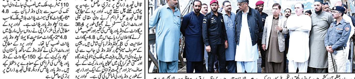
شاہراہ نیشنل کی ناقص تعمیر کارٹولس، کرپشن اور بددیانتی برداشت نہیں کریں گے، وزیراعظم آزاد کشمیر