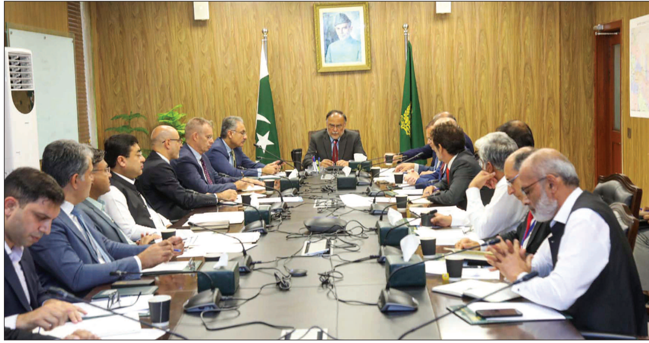
ISLAMABAD: Federal Minister for Planning, Development & Special Initiatives, Ahsan Iqbal, chairing the 4th meeting of the Policy and Strategy Committee (PSC) and the Oversight Board on Post-Flood Reconstruction Activities.

He urged the need to rise above partisan interests and committedly work for the welfare of the people, adding that he was against the politics of confrontation that harmed the country. The Parliamentarians from different political parties suggested various measures to bring stability and provide relief to the people. They also appreciated the President for his political wisdom and vision in evolving consensus on issues of national significance.