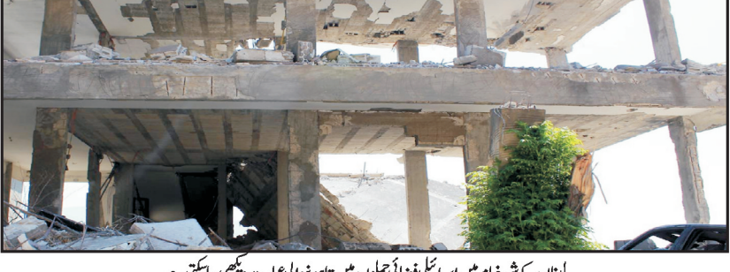
لبنان کے شہر خرام میں اسرائیلی فضائی حملوں میں تباہ و برباد ہوئی عمارت دیکھی جاتی ہے

رواں سال مون سون بارشوں کے باعث پنجاب میں 123 شہری جاں بحق اور 317 زخمی۔ انہوں نے کہا کہ وہ پاکستان کے خلاف بے نقاب گفتگو کر رہے ہیں۔ انہوں نے کہا کہ وہ پاکستان کے خلاف بے نقاب گفتگو کر رہے ہیں۔ انہوں نے کہا کہ وہ پاکستان کے خلاف بے نقاب گفتگو کر رہے ہیں۔