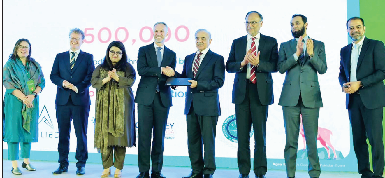
ISLAMABAD: President Asia Pacific of Google presents locally manufactured Chrome Book to Prime Minister Muhammad Shehbaz Sharif.