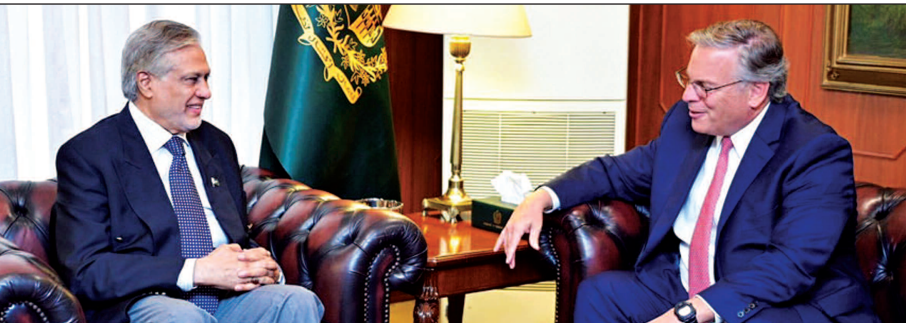
ISLAMABAD: US Ambassador Donald Blome called on Deputy Prime Minister and Foreign Minister Ishaq Dar.

The discussions centered on enhancing bilateral relations and celebrating the profound cultural bond between Pakistan and Thailand, rooted in their shared Buddhist heritage.