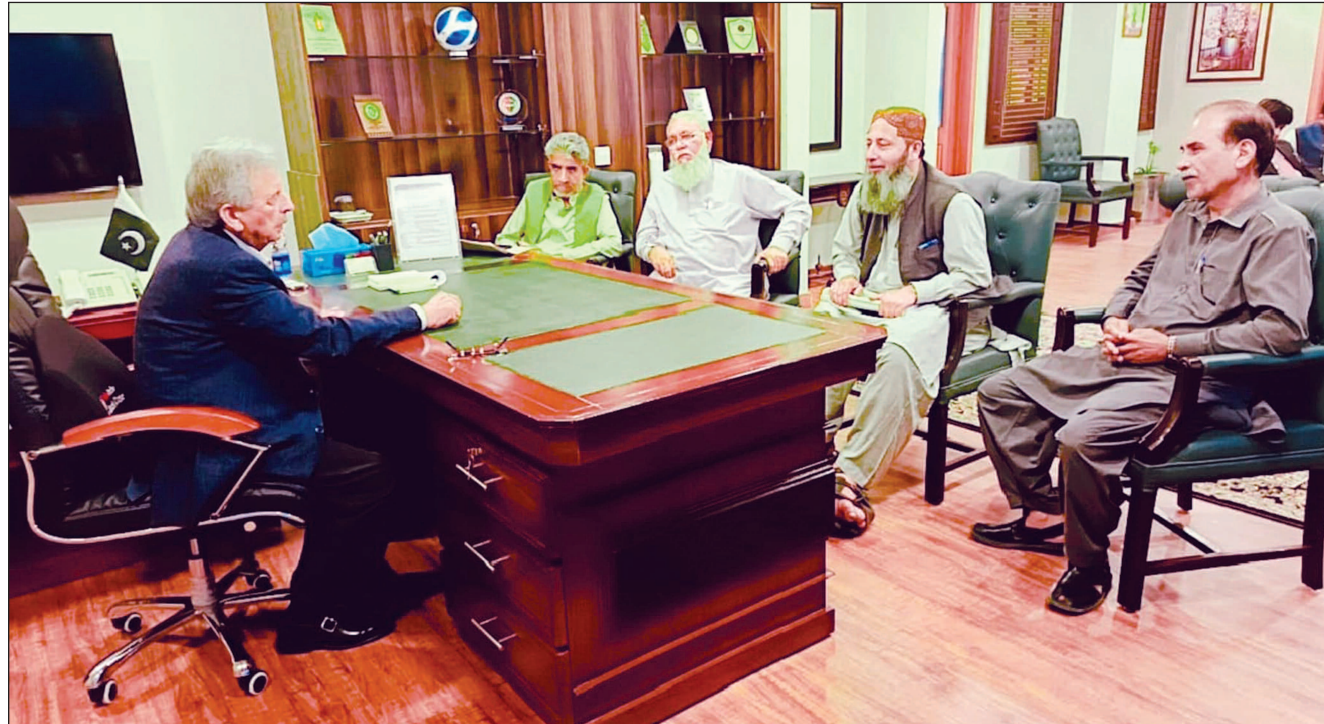
ISLAMABAD: A delegation of the Utility Store Corporation meets with Federal Minister for Industries and Production, Rana Tanveer Hussain.

The Prime Minister's Youth Programme continues to seek opportunities for international collaboration to empower the youth of Pakistan and to provide them with the skills and opportunities necessary to succeed in the global economy. DNA