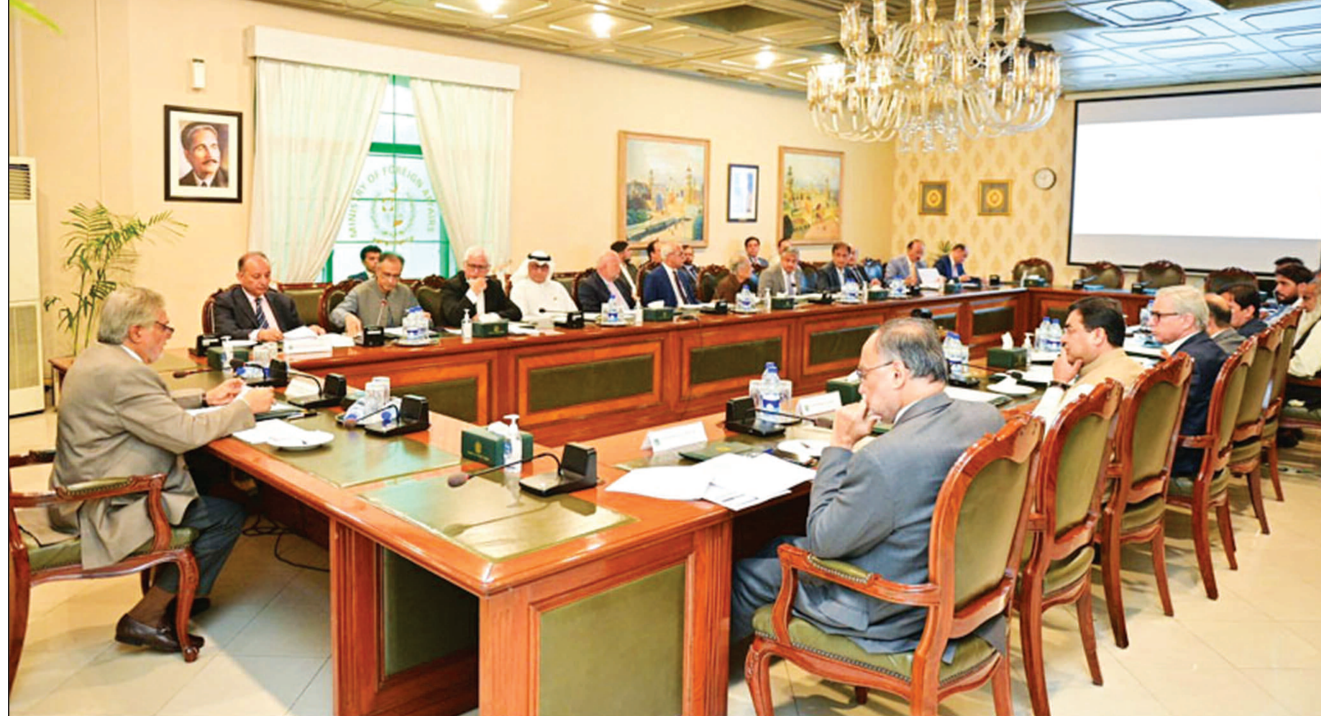
Deputy Prime Minister Ishaq Dar has expressed unwavering commitment of the government to support the petroleum industry and achieving energy self-sufficiency in Pakistan.

Nations Resident and Humanitarian Coordinator for Pakistan, called on Finance Minister Senator Muhammad Aurangzeb, at the Finance Division in Islamabad. Muhammad Yahya briefed the Finance Minister on the work of UN and its agencies undertaking development and humanitarian assistance projects in Pakistan. He also shared the success of UNESCAP and its work on debt consolidation in middle income countries. Muhammad Yahya noted that energy transition was an important area for possible cooperation with Pakistan. The Finance Minister shared the commitment of the government towards policy reforms and sustainable economic development and appreciated the cooperation provided by the UN and its agencies in this regard.