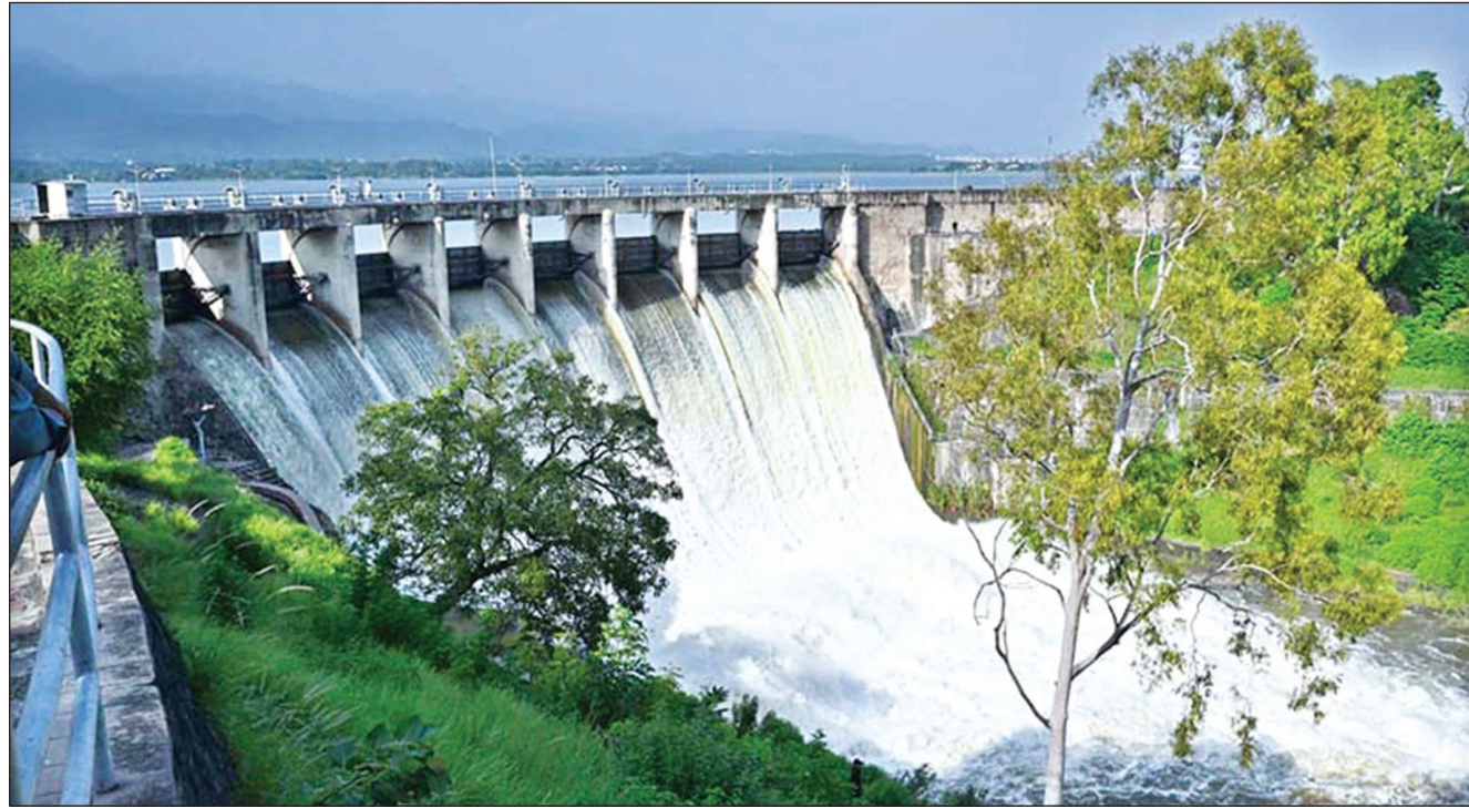
ISLAMABAD: Rawal Dam authorities open spillway of the reservoir after dam water level rose to alarming level due to heavy rain.