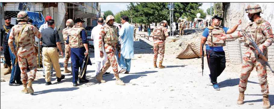
QUETTA: Security personnel at the site of explosion near a security forces check post at Chaman Phatak.

the National Center for Cyber Security (NCCS), Pakistan, will share their expertise and insights during the two-day event. The key topics on the agenda include International Space Treaties and Agreements, Space Governance and Regulatory Frameworks, National Space Policy of Pakistan, Space Diplomacy, Liability and Insurance in Space Activities, and Space Sustainability focusing on debris and environmental protection. The workshop will also address the increasingly critical issues of Space Security and Cyber Security, reflecting the intersecting challenges that lie at the forefront of contemporary space law and policy discussions. This landmark event represents a significant step forward for Pakistan in the global space community, aligning with the objectives of the newly approved National Space Policy.