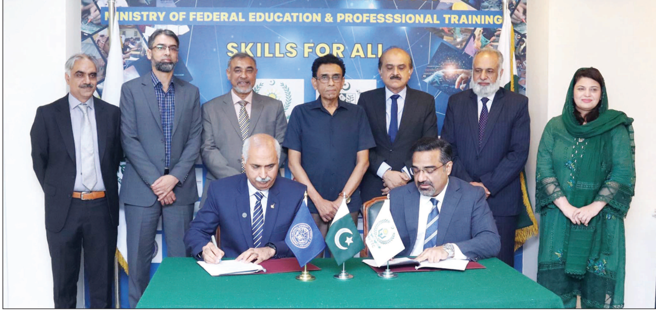
ISLAMABAD: National Vocational & Technical Training Commission (NAVTTTC) signed a landmark Joint Venture Agreement with the National University of Sciences & Technology (NUST). The agreement, which aims to provide specialized training in chip design and manufacturing, was formalized today at NAVTTTC headquarters in Islamabad. The signing ceremony was attended by the Honorable Minister for Federal Education, Khalid Maqbool Siddiqui as chief guest.