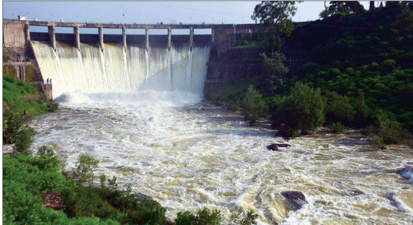
ISLAMABAD: District administration opened the spillways of Rawal Dam on August 25 at 6 am, and is actively monitoring the situation at rivers and bridges and has completed preparations for potential flood scenarios.

Chaudhry Salik Hussain noted historically and across cultures, women have been at the heart of religious education, guiding families and communities in spiritual matters. He said today, women continue to lead and innovate in religious spaces. They are breaking barriers to become prominent voices in theological scholarship, interfaith dialogues, and grassroots religious movements. He said women through their role as creators, preservers, and educators, have been pivotal in shaping and expanding cultural awareness. He said in literature, art, and media, women have made indelible marks. Moreover, women play a crucial role in cultural preservation and education. He was of the view that in modern times, women are also leading efforts to celebrate and educate others about diverse cultural heritages through museums, cultural festivals, and educational programs. "Encouraging women to continue their work in these areas ensures a richer, more inclusive cultural narrative. Their insights and creativity not only preserve cultural heritage but also promote intercultural understanding and respect", the minister added. (Picture on page 1)