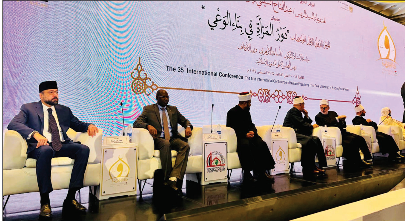
CAIRO: Federal Minister for Religious Affairs and Interfaith Harmony Chaudhry Salik Hussain attending an International Conference on role of Women in building awareness. INP

Commenting on Pakistan Tehreek-e-Insaf style of politics, he said PTI has a track record of challenging the state writ and attacking the institutions. The Minister said federal government has the right to stop such mobs to protect the country from the security risk. INP