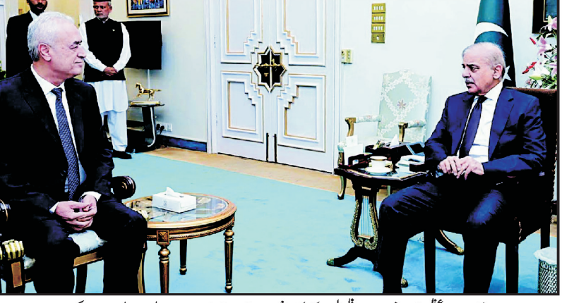
اسلام آباد، وزیر اعظم شہباز شریف نے فلسطین کے سکندر ہونے والے سفیر احمد جواد امجدی سے ملاقات کر رہے ہیں