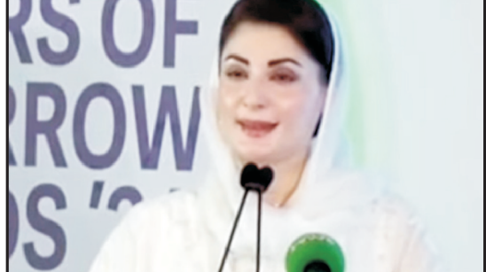
لاہور، وزیر اعلیٰ پنجاب مریم نواز تقریب سے خطاب کر رہی ہیں

تہران (ایس پی این) ایران کے وزیر دفاع نے کہا کہ ایران کا دفاع کا حق حاصل ہے۔ ان کا کہنا ہے کہ ایران کے وزیر دفاع نے کہا کہ ایران کا دفاع کا حق حاصل ہے۔ ان کا کہنا ہے کہ ایران کے وزیر دفاع نے کہا کہ ایران کا دفاع کا حق حاصل ہے۔