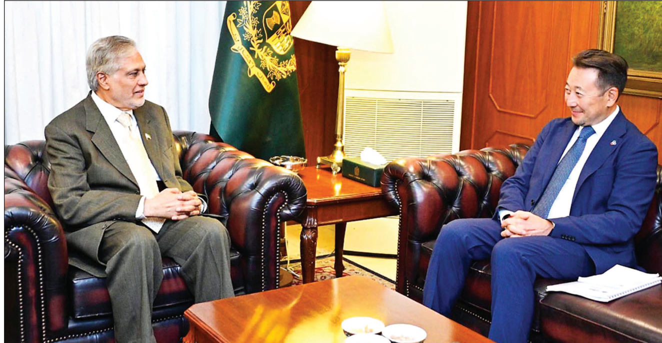
ISLAMABAD: Secretary General of the Conference on Interaction and Confidence Building Measures in Asia (CICA), Ambassador Kairat Sarybay called on Deputy Prime Minister and Foreign Minister Senator Mohammad Ishaq Dar. INP

Noting that the militants were involved in numerous terrorist activities in the area, the ISPR reaffirmed the forces' resolve to thwart attempts at sabotaging the peace, stability and progress of Balochistan. PR