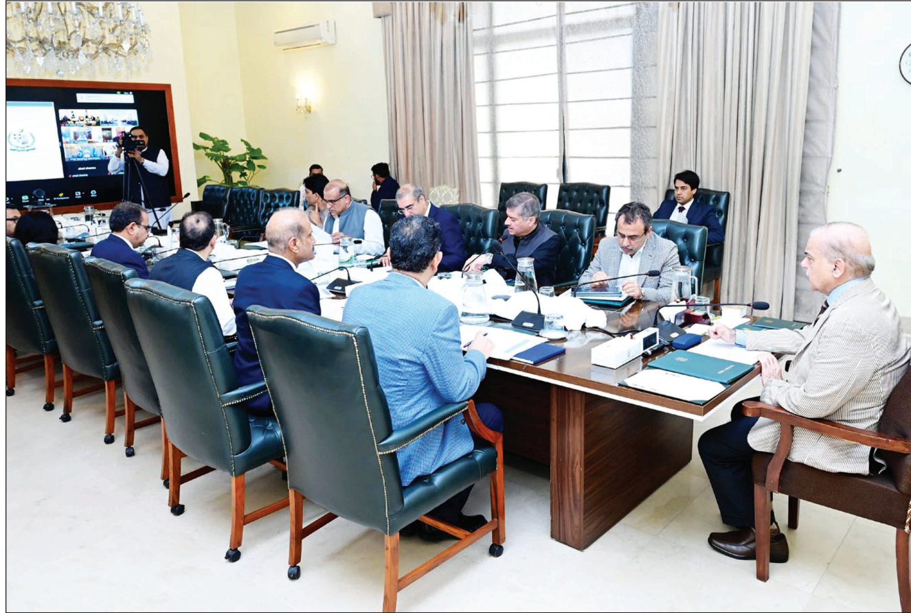
ISLAMABAD: Prime Minister Muhammad Shehbaz Sharif chairs a meeting on the matters related to Power Division, Ministry of Energy.

"Faiz-Niazi-Bushra nexus" had harmed the country to achieve their ulterior motives, he said alleging that the alliance was involved in inciting revolt in the state institution, he said adding, the Faiz-Niazi nexus also tried to create an impression that there was some kind of confusion or division in rank and file of the Pakistan Army. APP