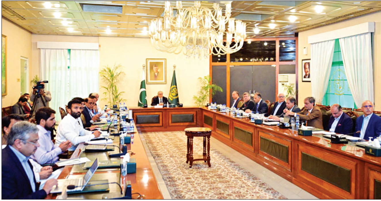
ISLAMABAD: Deputy Prime Minister and Foreign Minister Mohammad Ishaq Dar has said that government is taking steps to increase foreign investment in petroleum sector by resolving key issues, being faced by the sector. (Story on page 1)

ISLAMABAD: Prime Minister's Youth Programme Chairman Rana Mashhood Ahmed Khan on Sunday emphasized the crucial role of Pakistan's talented young generation in driving the country towards development, stressing that their energy, creativity, and innovative ideas were essential for propelling the nation forward. Talking to a private news channel, Khan highlighted the significance of empowering and engaging the youth in the development process, as they possess the potential to bring about transformative change and shape a brighter future for Pakistan. The Chairman also highlighted the need for youth to adopt a positive mindset, focusing on hope, resilience, and optimism. He believed that by spreading positivity, the youth could create a ripple effect, inspiring others to work towards a brighter future for Pakistan. Mashhood also emphasized that the PM's pro-women initiatives are a testament to his dedication to creating a more inclusive and equitable society. He noted, "Government is working tirelessly to address the challenges faced by women and to provide them with the resources and support they need to succeed." The Chairman also highlighted the importance of women's participation in the country's development, stating that empowering women is essential for achieving sustainable growth and prosperity. DNA