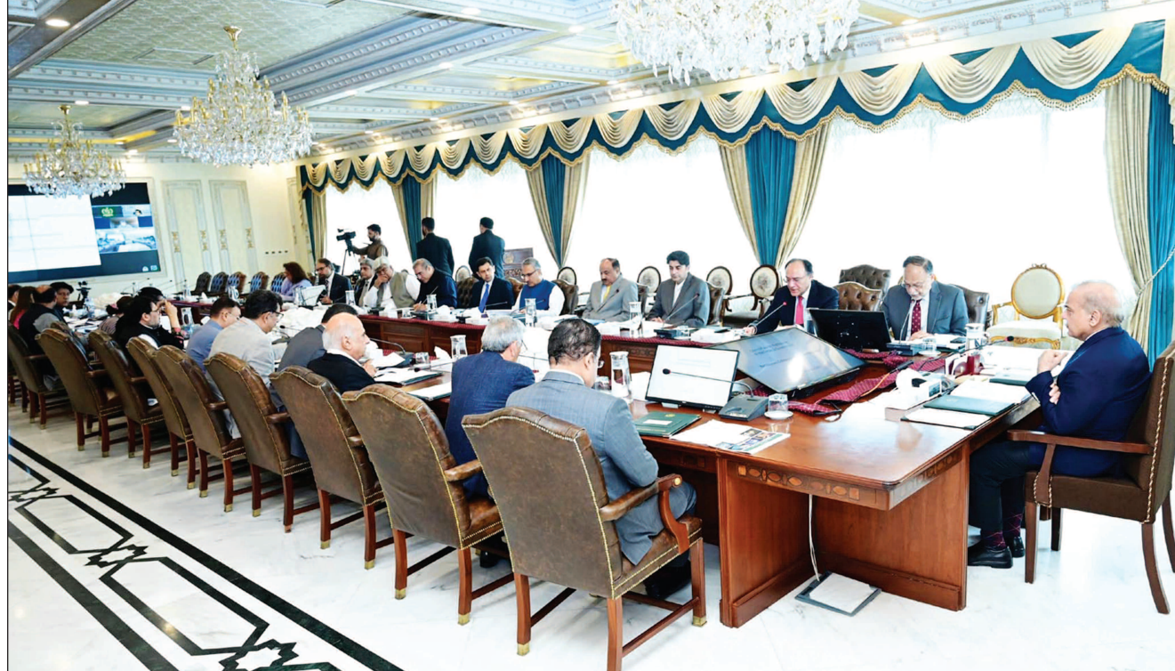
ISLAMABAD: PM Muhammad Shehbaz Sharif chairs a meeting on Rightsizing of Government Size.

Yesterday marked a tragic milestone in the ongoing war on the people of Gaza. Israeli occupation forces have massacred 40000 people, majority of them women and children. The ongoing genocide in Gaza must end and Israel should be held accountable for its war crimes and crimes against humanity. Pakistan strongly condemns the illegal storming of Al-Aqsa Mosque by hundreds of extremist settlers led by office bearers of the Israeli occupation authorities. Desecration of one of Islam's holiest sites and obstruction to the rights of worshippers have deeply hurt the sentiments of Muslims worldwide. This act is a violation of Geneva conventions and blatant disregard of multiple UNSC resolutions regarding the historical city of Jerusalem. We share the concerns of the Organization of Islamic Cooperation about the peril posed by the Israeli occupation's policies aimed at altering the Arab and Islamic character of the occupied city of Jerusalem. Pakistan calls on the international community, especially the United Nations Security Council, to take immediate action to end these serious and repeated transgressions against the sanctity of holy sites in Jerusalem; protect the Islamic character of Al-Aqsa; and to ensure the freedom of worship of the Palestinian people. Pakistan strongly condemns the killing of four Kashmiri youth by Indian troops in the Doda district of Indian illegally occupied Jammu and Kashmir (IOJK). SABAH