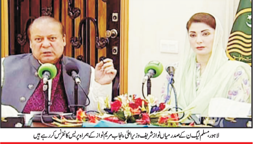
لاہور، مسلم لیگ ان کے صدر میاں نواز شریف و ذریعہ اہلی پنجاب مریم نواز کے ہمراہ پریس کانفرنس کر رہے ہیں