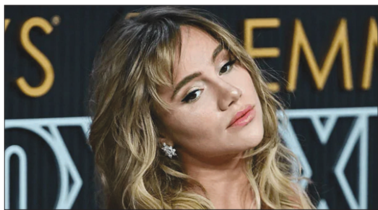
The album was completed just five days before the birth of her daughter

In a recent interview, she opened up about the album's semi-autobiographical nature, revealing that it explores themes she'd never discussed before.