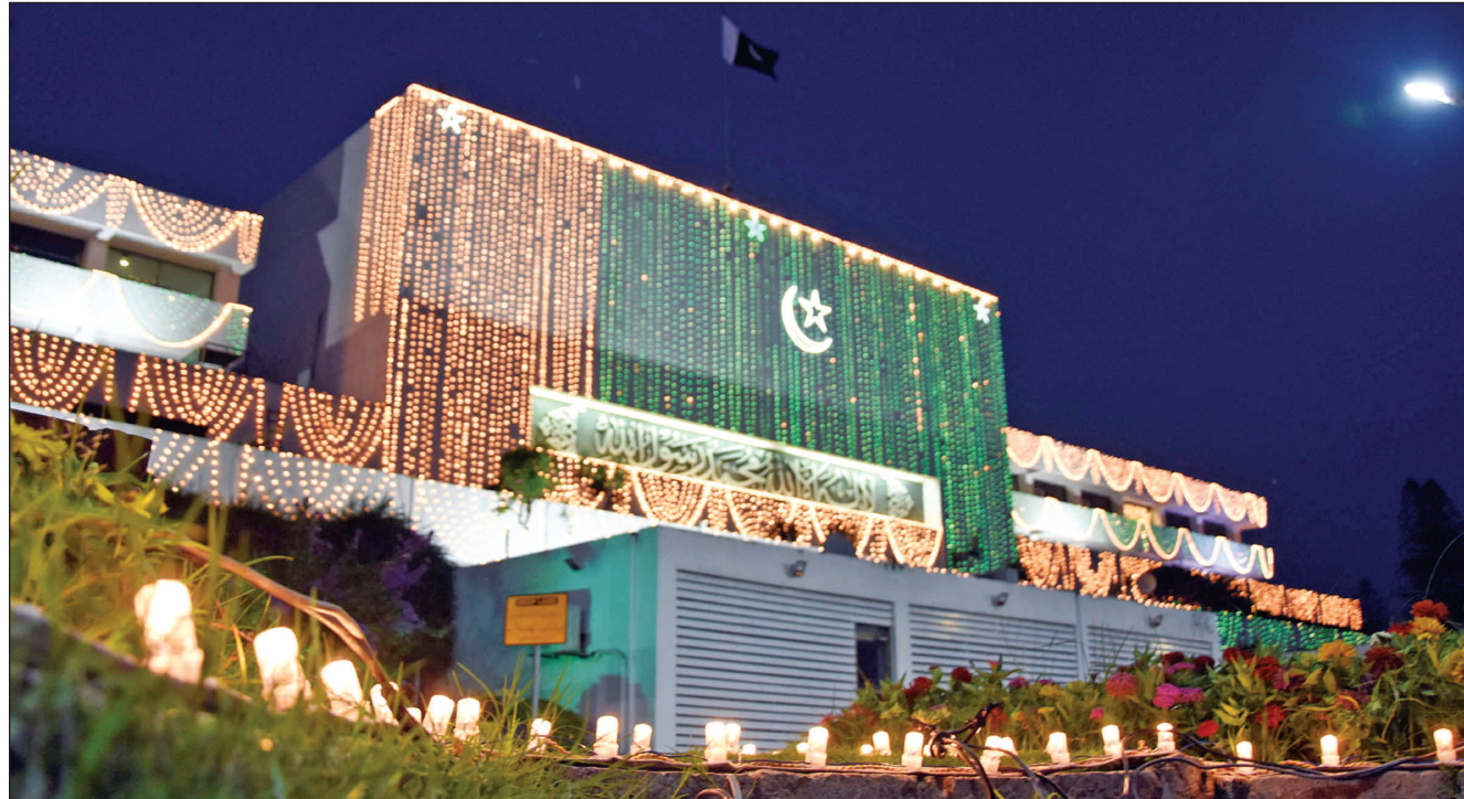
ISLAMABAD: An illuminated view of Parliament House building decorated with colorful lights for celebrate Independence Day 14th August, in the Federal Capital.

Quoting the former Prime Minister of Pakistan Shaheed Mohtarma Benazir Bhutto, "A society where women are marginalized is a society that cannot reach its full potential", Chairman Senate said that her words continue to guide his vision for Pakistan. He said that women bring unique perspectives and solutions to national challenges and their representation in decision-making processes is vital. He specifically acknowledged the role of Mohtarma Fatima Jinnah, Begum Rana Liaquat Ali Khan, Shaheed Mohtarma Benazir Bhutto, Justice Ayesha Malik, and late Asma Jahangir for their contribution in the fields of democracy, women's rights, social justice and equality. SABAH