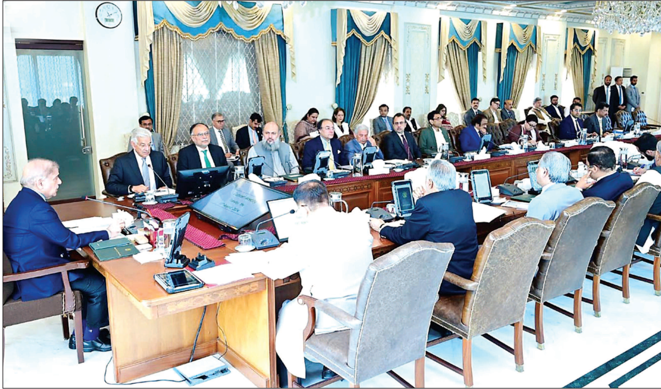
ISLAMABAD: Prime Minister Muhammad Shehbaz Sharif chairs Federal Cabinet Meeting..

ISLAMABAD: Minister of State for IT and Telecommunication Shaza Fatima Khawaja and Ambassador of Korea to Pakistan on Tuesday discussed matters of mutual interest, digitalization and Islamabad IT Park project. During a meeting with the Ambassador, the minister said Pakistan greatly values its ties with Republic of Korea. She said both Pakistan and Korea can benefit from each other's experiences in the field of IT and Telecommunication. She said on the directives of the Prime Minister of Pakistan, steps are being taken for digitalization in the country. Governance, economy and services are being digitized, she added. Shaza Fatima also emphasised upon exchanging tech experts between the two countries and starting joint training program in the field of IT & Telecom. The minister offered thanks to the government of Korea for cooperation in construction of IT Park in Islamabad. "Islamabad IT Park is very important project and government wants its completion as soon as possible", she added. The Ambassador said that Korea wanted to enhance cooperation with Pakistan in the field of IT and Telecommunication. APP