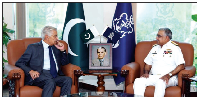
ISLAMABAD: Defence Minister, Khawaja Muhammad Asif on Monday visited Naval Headquarters (NHQ) here and called-on Chief of the Naval Staff Admiral Naveed Ashraf. During the meeting, matters about the Regional Maritime Security milieu and operational readiness of the Pakistan Navy were discussed, a Pakistan Navy news release said.

The naval chief apprised the minister on maritime challenges and the Pakistan Navy's preparedness to meet them. The minister was also briefed on the Pakistan Navy's future capability enhancement and modernization plans.