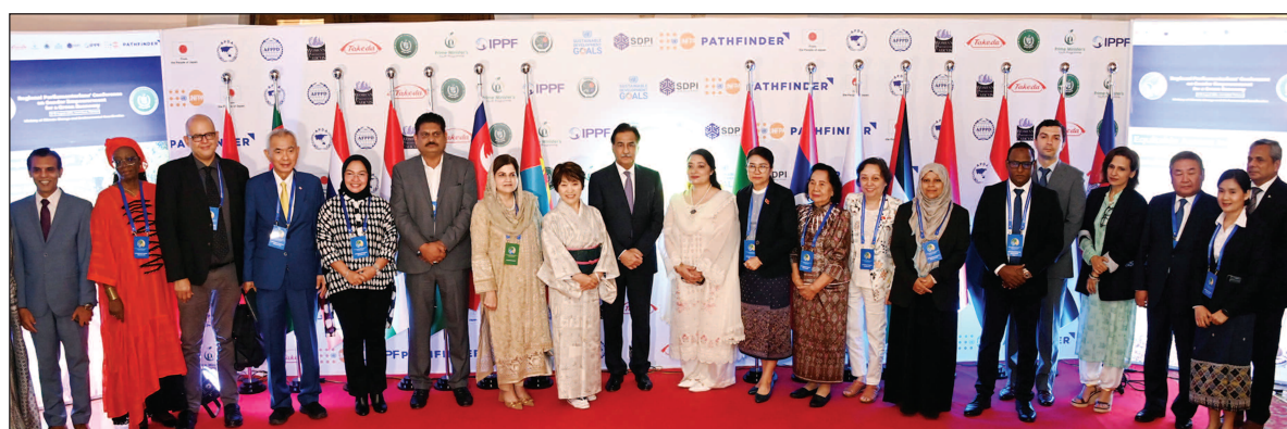
National Assembly's residence and the Parliament building were first converted over solar energy when there was no public building with solar power in the country," he mentioned. Pakistan, he said, had prepared billions of rupees project for solarization of Balochistan that would not only help reduce power leakages, but also ensure

"The Parliament of Pakistan became the first public building for securing net metering license to promote green economy and renewables. The Speaker