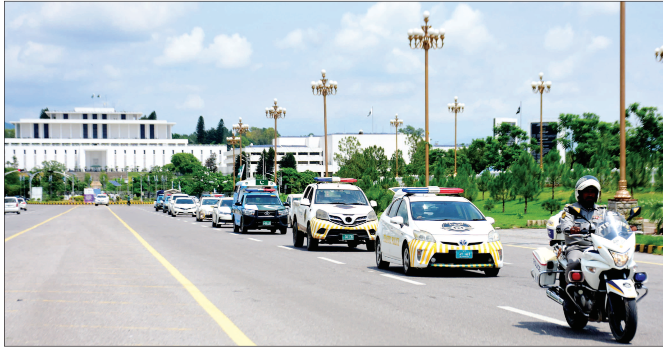
ISLAMABAD: Islamabad Police and law enforcement agencies conducting a flag march in connection with Independence Day security. Flag march started from the sports complex and passed through different areas of the city and ended back at the sports complex in the Federal Capital.