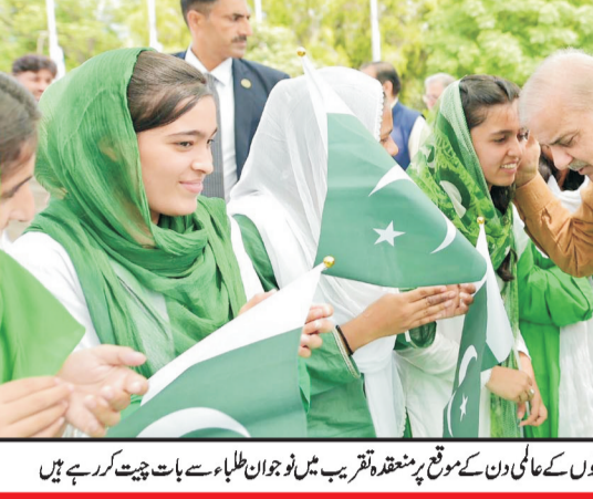
اسلام آباد، وزیر اعظم شہباز شریف نوجوانوں کے عالمی دن کے موقع پر منعقدہ تقریب میں نوجوان طلباء سے بات چیت کر رہے ہیں۔

اسلام آباد (پبلک رپورٹر) صدر مملکت آصف علی زرداری نے یوم آزادی کے موقع پر قیدیوں کی سزائیں 90 روز کی کر دی۔