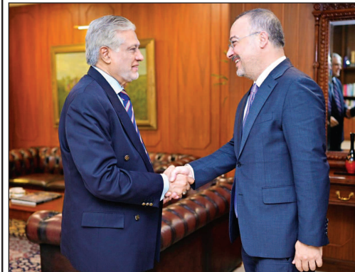
ISLAMABAD: Turkish Deputy Minister of the Ministry of Foreign Affairs, Nuh Yilmaz called on the Deputy Prime Minister and Foreign Minister Senator Mohammad Ishaq Dar on Monday in Islamabad. Ishaq Dar reaffirmed Pakistan's commitment to further strengthen Pakistan-Turkiye bilateral relations with special focus on trade, investment, IT and defence cooperation.