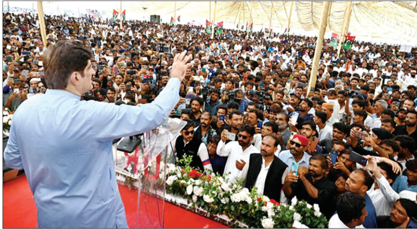
BADIN: Chief Minister Sindh Syed Murad Ali Shah addressing to public gathering during inauguration ceremony of newly constructed regulator of spinal drain of LBOD at RD210 near Shadi Large.

As one of the organisation's founding members, Pakistan values the Commonwealth as an important forum for forging consensus on global issues and challenges. The visit of the Commonwealth Secretary-General would provide an important opportunity to further strengthen the longstanding partnership between Pakistan and the Commonwealth.