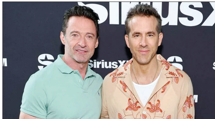
Ryan nodded in agreement as he pointed out that their bond is the "hallmark of a truly great friendship"

Ryan Reynolds and Hugh Jackman offered an inside scoop on their long-lasting friendship just days ahead of the release of their joint project, Deadpool & Wolverine . During an exclusive conversation with Entertainment Tonight's Spilling the E-Tea, Hugh, who first met Ryan in 2008 on the set of X-Men Origins: Wolverine , revealed the best thing about their friendship. He said, "I could literally tell you anything and also how I feel both of us - I'm stealing a little bit 'cause you described this perfectly - we are genuinely rooting for each other in every aspect of our lives."