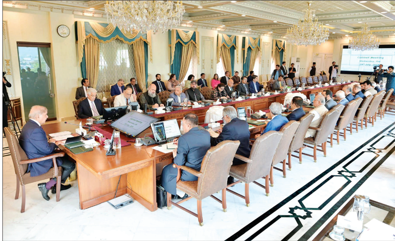
ISLAMABAD: Prime Minister Muhammad Shehbaz Sharif chairs a meeting of the Federal Cabinet.

The Human Rights Commission of Pakistan (HRC) and the US State Department also expressed concerns over PM Shehbaz's government's move to ban the former ruling party as well. INP