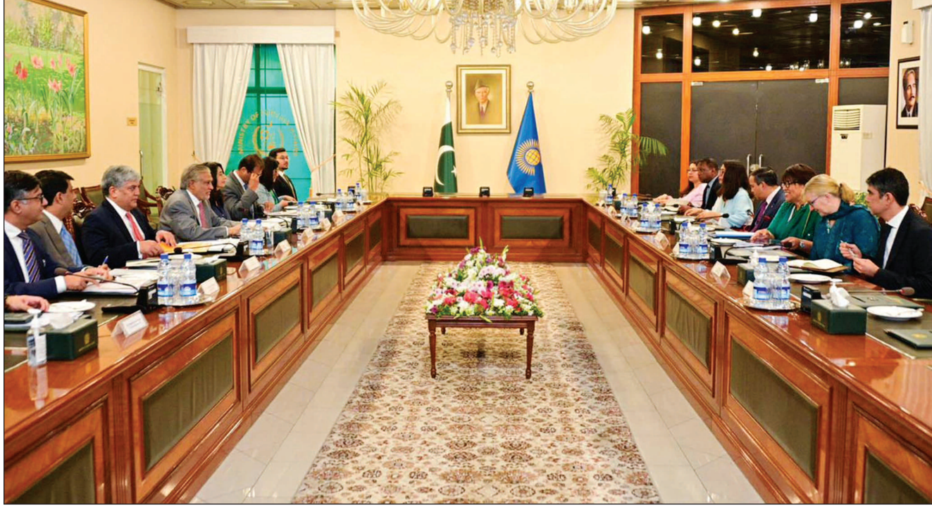
ISLAMABAD: Deputy Prime Minister and Foreign Minister Senator Mohammad Ishaq Dar holds meeting with Secretary General of the Commonwealth Patricia Scotland at the Ministry of Foreign Affairs.

Commenting on role of Independent Power Producers (IPPs), he said there is a need to revisit the agreements so that burden could be minimized on energy users in future.