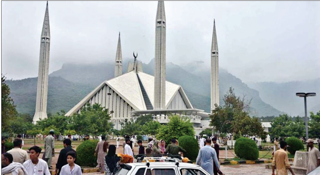
ISLAMABAD: A large number of people visiting famous Faisal Masjid to spend their holiday during cloudy weather in Federal Capital.

As one of the organisation's founding members, Pakistan values the Commonwealth as an important forum for forging consensus on global issues and challenges.