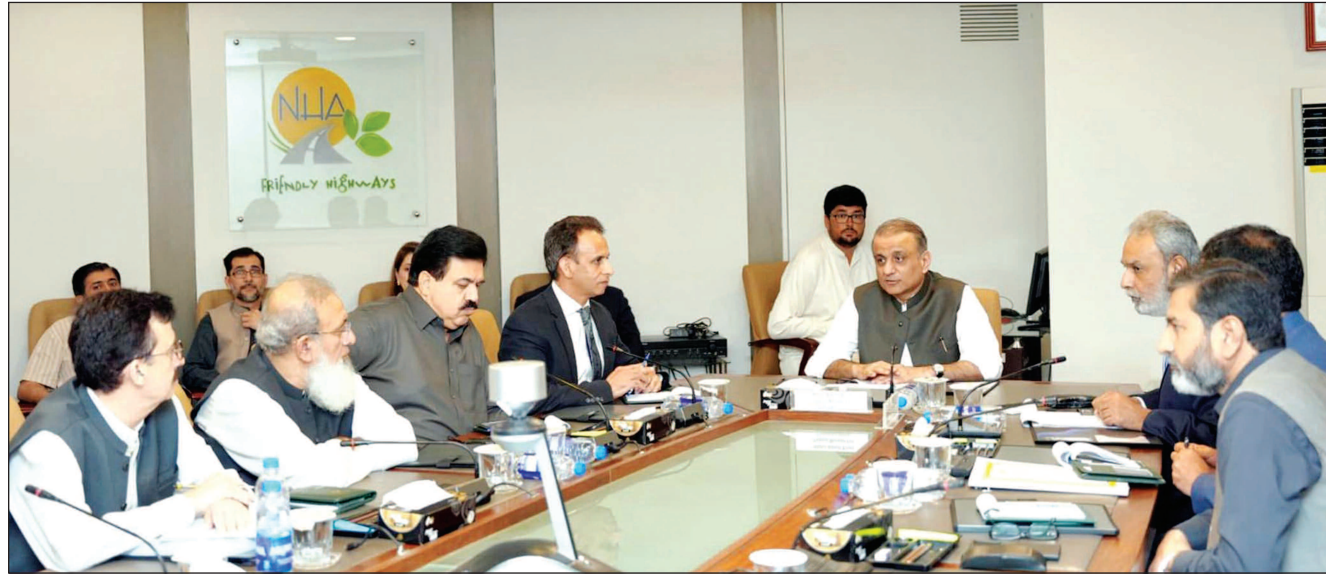
ISLAMABAD: Federal Minister for Communications, Privatization and Board of Investment, Abdul Aleem Khan chaired a high-level meeting of the National Highway Authority.

This meeting marked a significant step towards fostering a deeper understanding and cooperation between Pakistani representatives and British parliamentarians in addressing crucial human rights issues globally.