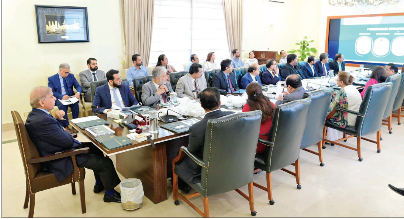
ISLAMABAD: Prime Minister Muhammad Shehbaz Sharif chairs a meeting regarding Prime Minister's Youth Programme.

Later, Senator Muhammad Aurangzeb Federal Minister for Finance & Revenue and Sardar Awais Ahmad Khan Laghari Minister for Energy (Power Division) also held a useful meeting with the President of China Export and Credit Insurance Corp (SINOSURE) at its Headquarters and discussed the latest reform agenda of the government of Pakistan. During the meeting, both ministers lauded SINOSURE's role in the development of Pakistan, particularly during the first phase of CPEC. They showed confidence that SINOSURE will continue its full support for completing ongoing and new projects under the second phase of CPEC especially now led by the private sector. President of China Export and Credit Insurance Corp (SINOSURE) welcomed the delegation and reiterated Sinosure's commitment towards the execution of socio-economic uplift projects under CPEC including B2B projects. SABAH