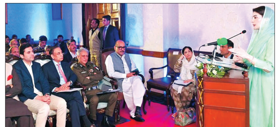
LAHORE: Punjab Chief Minister Maryam Nawaz addressing the inaugural ceremony of the Punjab Socio-Economic Registry.