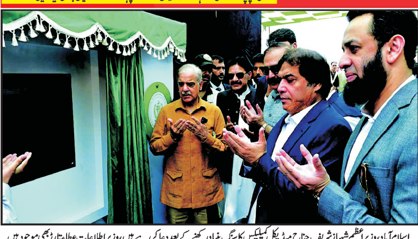
اسلام آباد، وزیر اعظم شہباز شریف جناح میڈیکل کالج بنیاد رکھنے کے بعد دعا کر رہے ہیں، وزیر اطلاعات عطاء اللہ تارڑ بھی موجود ہیں۔

سپیکر قومی اسمبلی نے قائمہ کمیٹیوں کے چیئرمین کا کافی گارڈیوں کا مطالبہ مسترد کر دیا اسلام آباد (خبر) سپیکر قومی اسمبلی ایاز صادق کا بازنائے قائمہ کمیٹیوں کے چیئرمین کا کافی گارڈیوں کا مطالبہ مسترد کر دیا۔ اسپیکر نے کہا کہ ان کے مطابق قائمہ کمیٹیوں کے چیئرمین نے سپیکر ایاز صادق سے کافی گارڈیوں کا مطالبہ کیا تھا، تاہم کمیٹیوں کے چیئرمین کے لیے پہلے سے موجود کافی گارڈیوں کا مطالبہ نہیں کیا گیا۔ اسپیکر نے کہا کہ ان کے مطابق قائمہ کمیٹیوں کے چیئرمین نے سپیکر ایاز صادق سے کافی گارڈیوں کا مطالبہ کیا تھا، تاہم کمیٹیوں کے چیئرمین کے لیے پہلے سے موجود کافی گارڈیوں کا مطالبہ نہیں کیا گیا۔