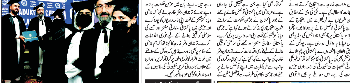
پشاور صوبائی تعلیم بھانڈا خان آفریدی فریئر لاکھانج کے فارغ التحصیل طلبہ بگڑے دس دنوں سے ہیں۔

اسلام آباد (خبر) وزیراعظم شہباز شریف نے کہا ہے کہ بجلی کی قلت کی وجہ سے لوڈ شیڈنگ کا سبب بن گیا ہے۔ انہوں نے کہا کہ حکومت کو بجلی کی قلت کو دور کرنے کے لیے اپنی تمام طاقتوں کو جمع کرنا چاہیے۔ انہوں نے کہا کہ حکومت کو بجلی کی قلت کو دور کرنے کے لیے اپنی تمام طاقتوں کو جمع کرنا چاہیے۔