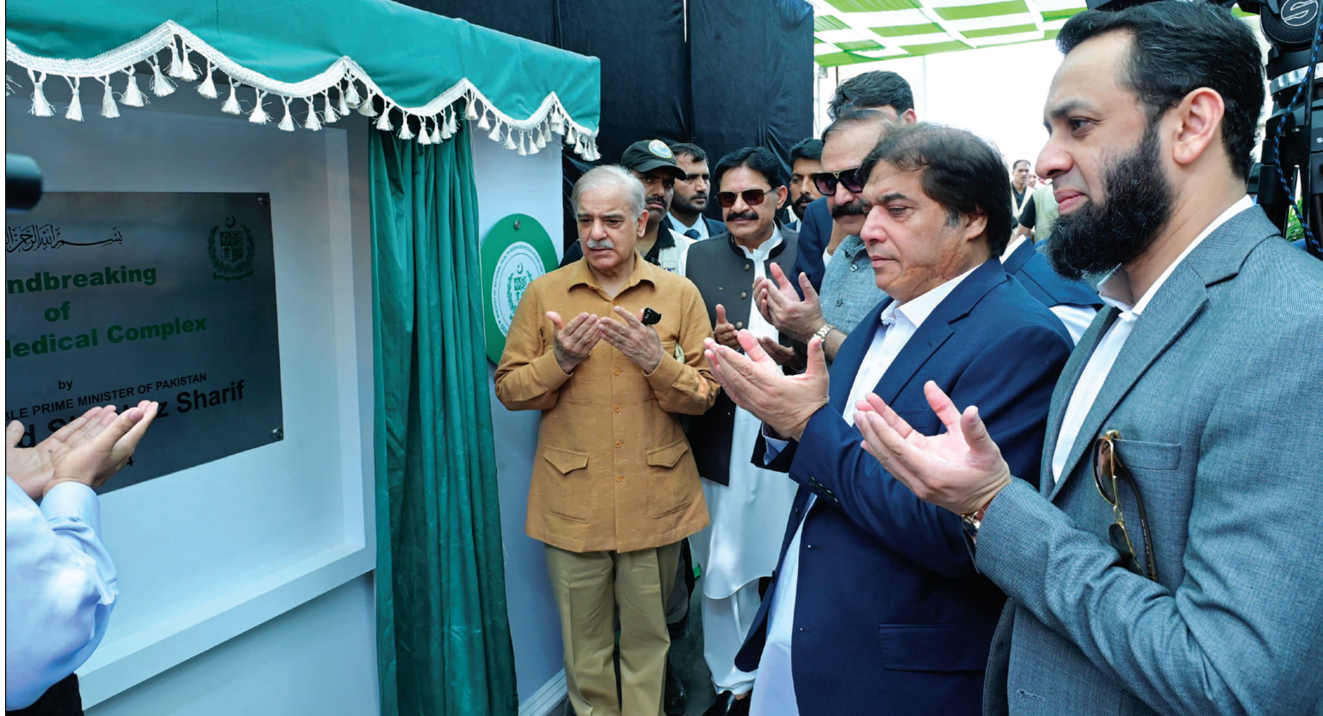
ISLAMABAD: Prime Minister Muhammad Shehbaz Sharif offering dua after unveiling a plaque during the groundbreaking of Jinnah Medical Complex.

Earlier, the meeting discussed at length the mountaineering and climbing curriculum, modules for relevant skill development, rescue trainings, identification of site for building mountaineering school, training programme for local tour guides and potential funding opportunities and collaboration opportunities for establishing and managing the proposed mountaineering school facility.