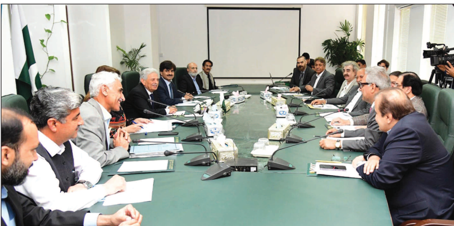
ISLAMABAD: Federal Minister for Industries & Production, Rana Tanveer Hussain chaired a meeting of the Sugar Advisory Board (SAB).