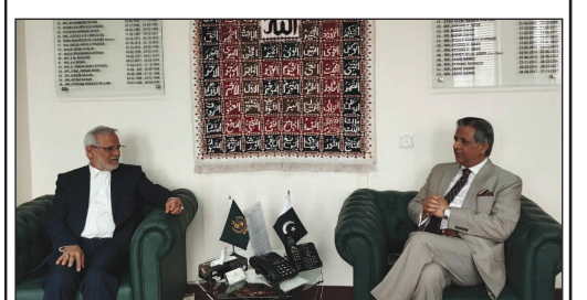
Meeting of the Iranian delegation with the Minister for Law and Justice senator Azam Nazeer Tarar happened today at Law Ministry.

The JI Shura had proposed three names for the consideration of the JI members: the current Emir Sirajul Haq, vice-emir Liaqat Baloch, and Hafiz Naeem. However, members were also free to suggest any other name as well. It's noteworthy that Jamaat-e-Islami is the only political party in Pakistan that regularly conducts intra-party elections since its establishment in 1941. The party's founding Emir was Syed Maududi, a renowned religious scholar, writer, and politician. Subsequently, Mian Tufail Muhammad, Qazi Hussain Ahmad, Syed Munawar Hassan, and Sirajul Haq served as the second, third, fourth, and fifth Emirs of JI, respectively. INP