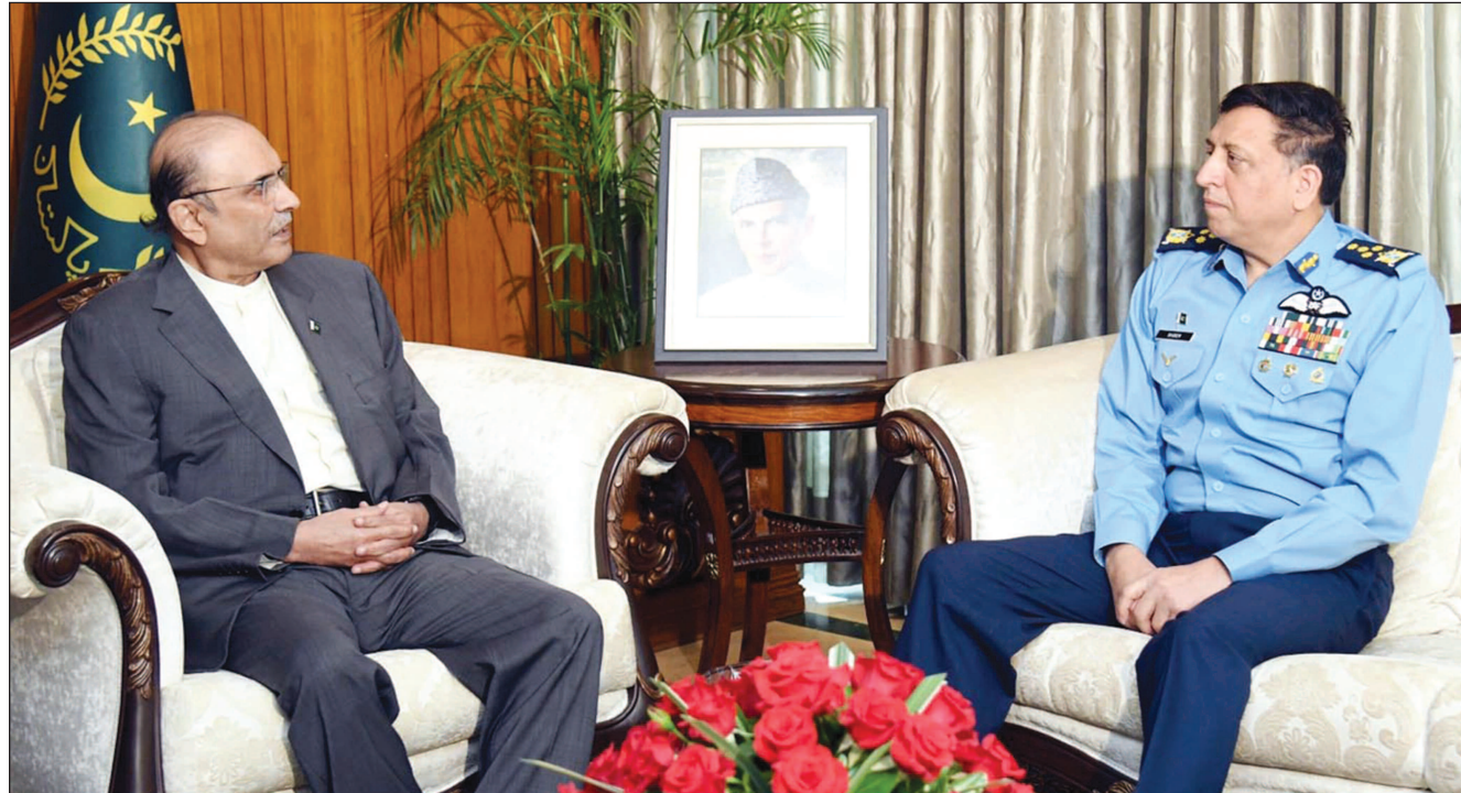
ISLAMABAD: Chief of the Air Staff, Air Chief Marshal Zaheer Ahmed Baber Sidhu, called on President Asif Ali Zardari, at Aiwan-e-Sadr.

Through the Pre-Budget Seminar, participants learned how they can provide feedback and recommendations to policymakers on tariff structure and rationalization measures.