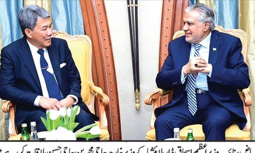
ریاض، نائب وزیر اعظم اسحاق ڈار ملائیشیا کے وزیر خارجہ جی جی ہائی سے ملاقات کر رہے ہیں

لاہور (پبلک سروس) وفاقی وزیر داخلہ حسن نواز شریف نے پاسپورٹ آفس کا دورہ کیا اور ڈائریکٹر کو تبدیل کیا۔