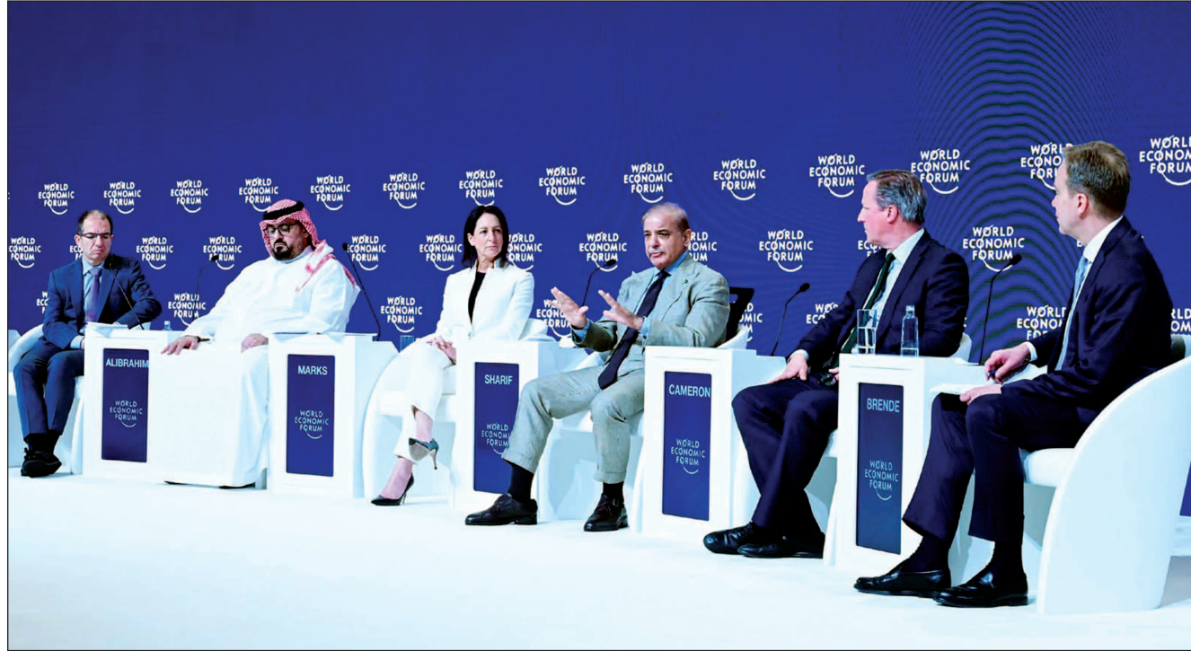
Riyadh: Prime Minister Muhammad Shehbaz Sharif speaks at a Closing Plenary-Rejuvenating Growth, at a Special Meeting of the World Economic Forum.

between their Armed Forces and committed to further expand defence collaboration. The defence minister also appreciated Turkiye's strong support for Pakistan on multiple forums. He also stated that enhanced defence cooperation was an important aspect of the bilateral relationship, characterized by Joint Projects, Joint Exercises and Military Training. — VOM Report