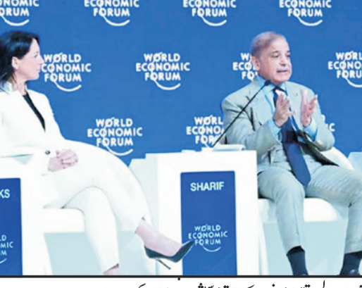
ریاض، وزیر اعظم شہباز شریف عالمی اقتصادی فورم کے اختتامی سیشن سے خطاب کر رہے ہیں

پشاور (پبلک سروس) وزیر اعظم شہباز شریف نے کہا ہے کہ آئین میں ڈپٹی وزیر اعظم کے عہدے کی کوئی گنجائش نہیں ہے۔