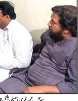
جھنگ، بھرتیوی کی اسمبلی میں شہداء کی شہادت اور صلوات اعلیٰ علیہم اجمعین سے دعا کی گئی

اسلام آباد (پبلک سروس) ٹریک اینڈ ٹریس سسٹم ناکامی کی تفصیلات سامنے آئیں۔