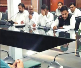
اسلام آباد، صدر ایچ آصف زرداری اور وزیر اعظم شہباز شریف نے ملاقات کی

ریاض (ٹریک اینڈ ٹریک) وزیر اعظم شہباز شریف نے سعودی ولی عہد کے گالا ڈنر میں شرکت کی۔