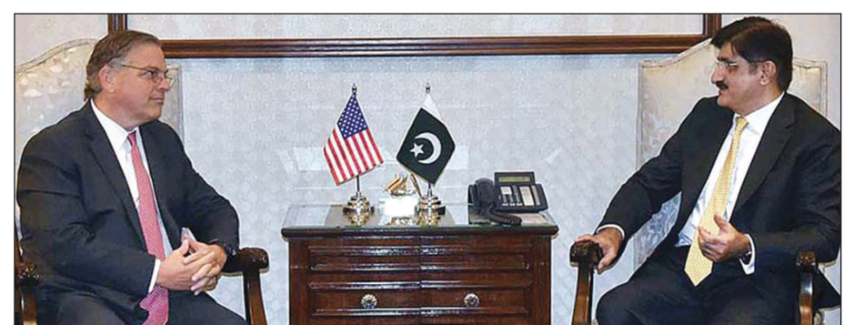
KARACHI: Sindh Chief Minister Syed Murad Ali Shah meets American Ambassador Donald Blome at CM House.