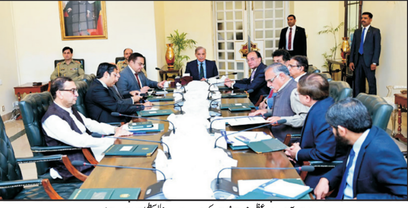
اسلام آباد، وزیر اعظم شہباز شریف کی زیر صدارت اعلیٰ سطح کا اجلاس جاری ہے۔