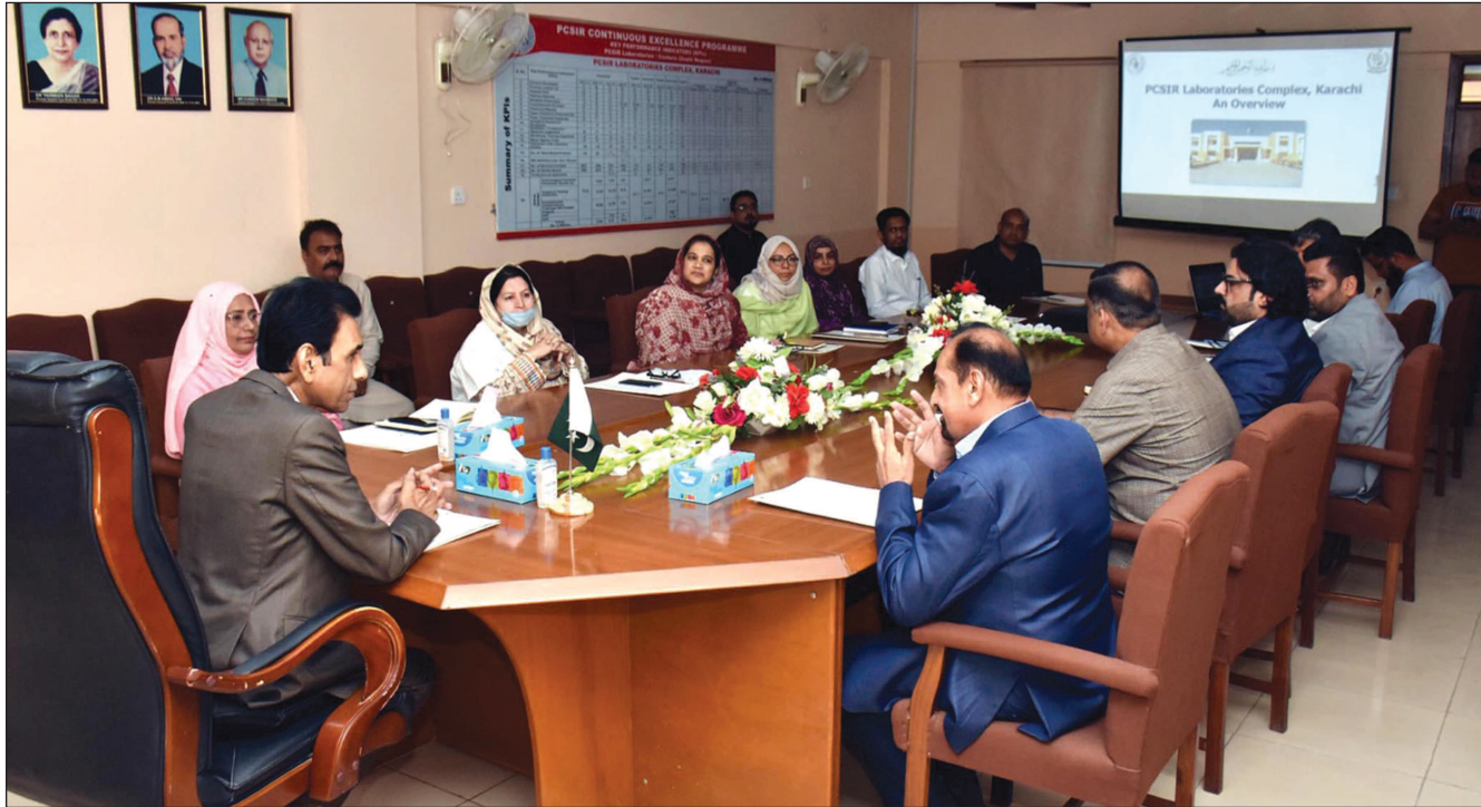
KARACHI: Federal Minister for Science & Technology Khalid Maqbool Siddiqui is chairing a meeting at PCSIR Laboratories Complex.