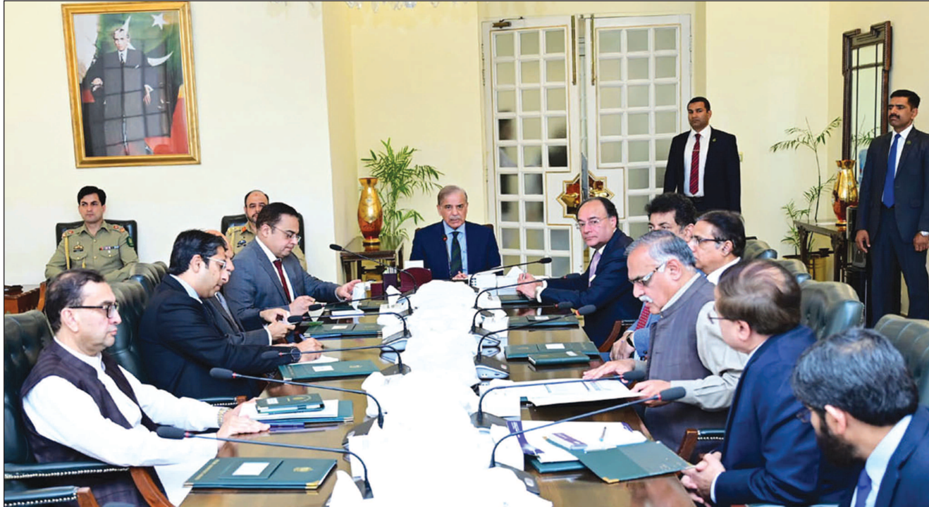
ISLAMABAD: Prime Minister Muhammad Shehbaz Sharif chairs a meeting regarding implementation of Track and Trace System.