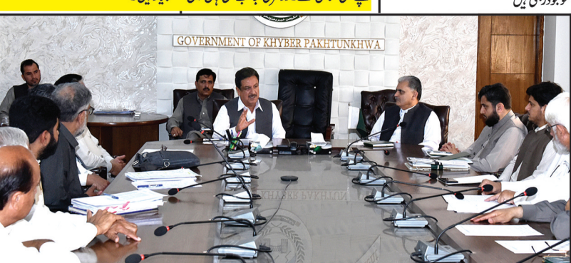
ذریعہ بلدیاتی ارشد ایڈیٹوریل کونسل بورڈ ملازمین کی پیشین ہارے اجلاس کی صدارت کر رہے ہیں

ماسکو (پہلو رپورٹ) روس کے دار الحکومت ماسکو کے کراچی میں ہال میں کنسرٹ پر حملہ کرنے والے 4 ملزمان کو پرفرہ جرم عائد کیا گیا۔ انہوں نے کہا کہ ماسکو کے کراچی میں ہال میں کنسرٹ پر حملہ کرنے والے 4 ملزمان کو پرفرہ جرم عائد کیا گیا۔ انہوں نے کہا کہ ماسکو کے کراچی میں ہال میں کنسرٹ پر حملہ کرنے والے 4 ملزمان کو پرفرہ جرم عائد کیا گیا۔