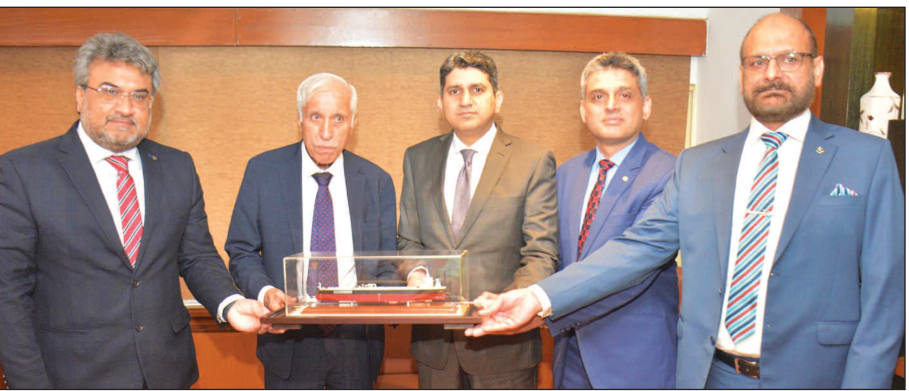
KARACHI: Federal Minister for Maritime Affairs Qaiser Ahmed Shaikh is Presented with memento during his visiting Pakistan National Shipping Corporation(PNSC).

He said that the International Monetary Fund (IMF) had set conditions under that the government could not provide subsidy. The Federal Commerce Minister Jam Kamal Khan said that the governments would have to make efforts for balancing supply and demand chain to provide relief to the people. APP