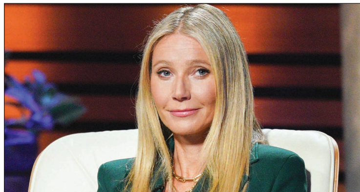
Expectations actress. Addressing reality TV, Paltrow shared she found out about reality show during the pandemic, mentioning her

"I love on a Sunday to not do anything, watch rubbish TV and not make dinner and order in food. I really need one slovenly day," stated the Great