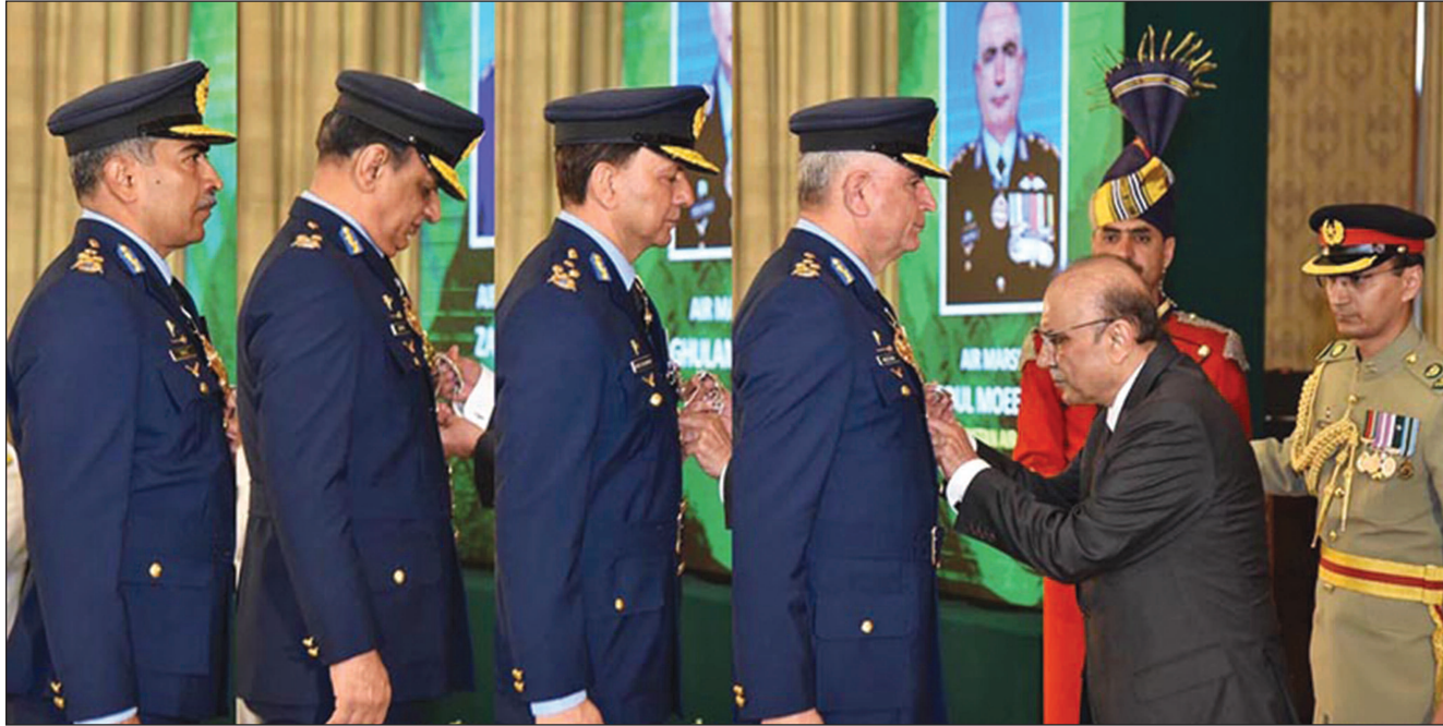
ISLAMABAD: President Asif Ali Zardari conferring the insignias of Hilal-i-Imtiaz (Military) upon officers of the Pakistan Armed Forces, at Aiwan-e-Sadr.