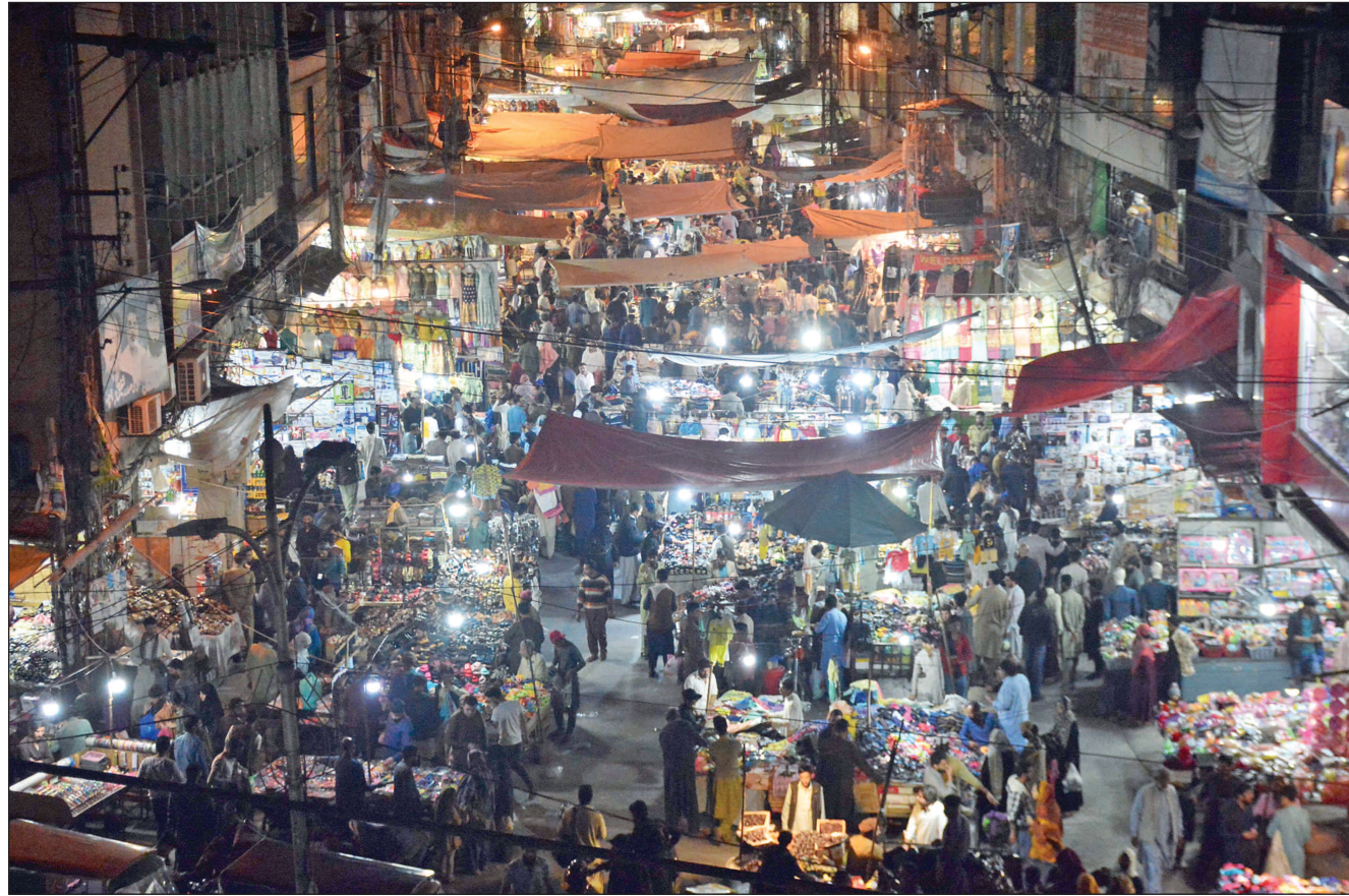
RAWALPINDI: A large number of citizens engaged in Eid shopping in Bara market at night in the city.

"Our mission is helping the people of Pakistan to improve water management systems, build markets for Climate Smart Agriculture technologies and techniques and mobilized climate adaptation finance under the US-Pakistan green Alliance initiative," Ms. Power said. "We remain committed to standing with Pakistan as it continues the long and difficult recovery from the floods while building a more resilient and more prosperous future," she added. Congratulating Ms. Power on receiving national award of Pakistan, Pakistan's Ambassador to the United States Sardar Muhammad Masood Khan said that Ms. Power is a true friend of the people of Pakistan. We will never forget her humanitarian services at a time when we needed them the most. SABAH