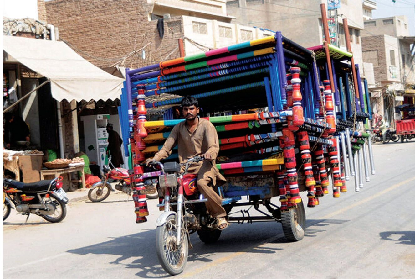
MULTAN: A tricycle holder on the way loaded with traditional beds (Charpai) heading toward his destination.

He informed that the conference would be comprised all faith leaders as the invitations will be tendered to Imam of Khana-e-Kaba, Grand Imam of Palestine, Sheikh Al-Azhar, Pop Francis, Bishop of Canterbury and others.