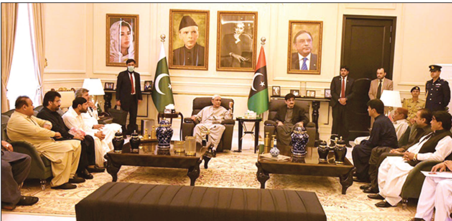
NAWABSHAH: President Asif Ali Zardari meets with elected representative at Zardari House.