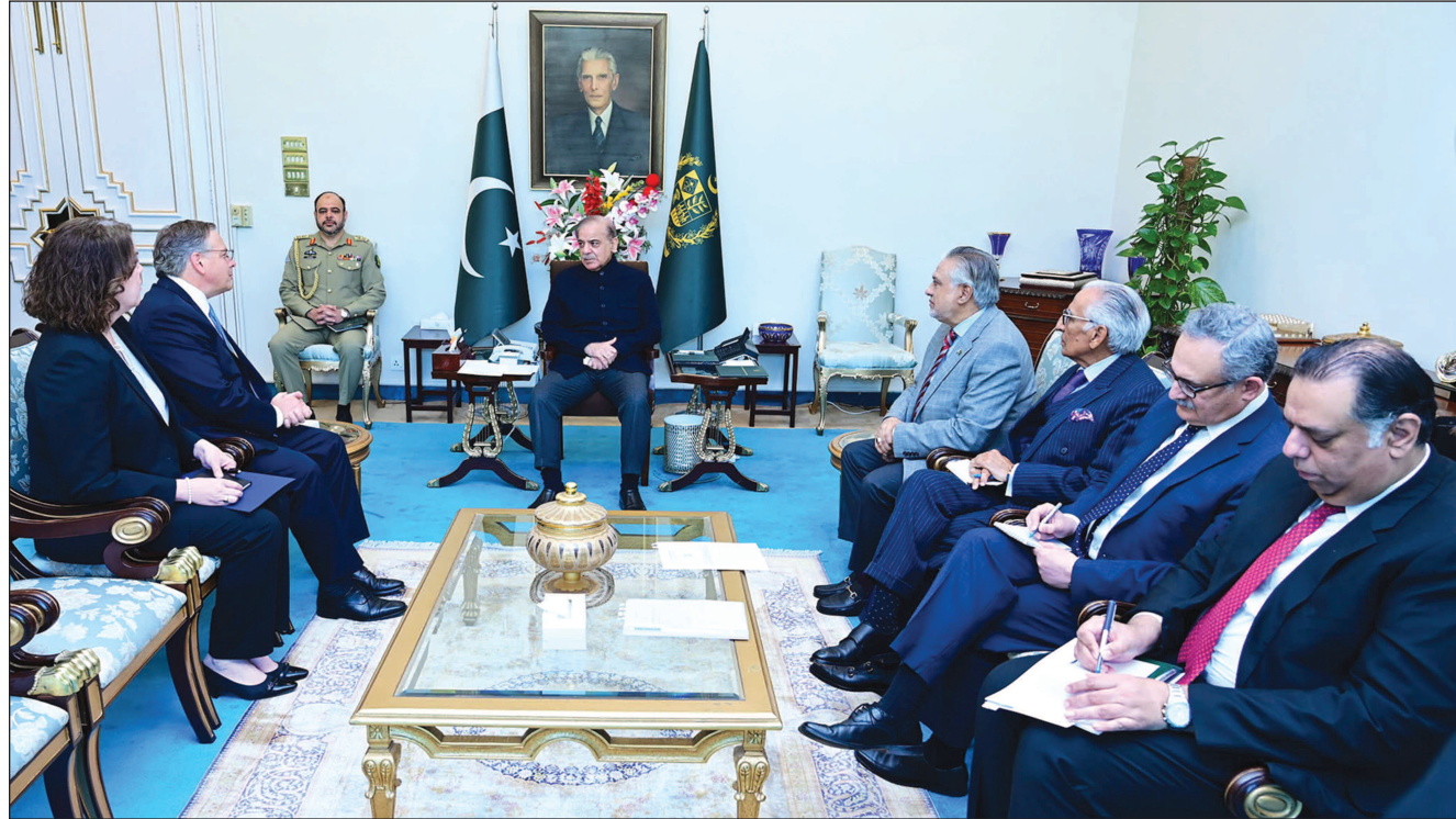
ISLAMABAD: Ambassador Donald Blome, Ambassador of the United States of America to Pakistan calls on Prime Minister Muhammad Shehbaz Sharif.

The Ambassador acknowledged the economic agenda of the Government and assured the Finance Minister of EU's continued support to Pakistan.