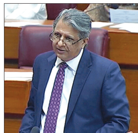
Establishment of Telecommunication Appellate Tribunal Ordinance, 2023 (Ordinance No. VIII of 2023). APP

The resolution was moved by the Minister for Law and Justice, Azam Nazeer Tarar. The extension was granted under the proviso to sub-paragraph (ii) of paragraph (a) of clause (2) of Article 89 of the Constitution of the Islamic Republic of Pakistan. The Ordinances included The Pakistan Broadcasting Corporation (Amendment) Ordinance, 2023 (No. II of 2023), The Pakistan National Shipping Corporation (Amendment) Ordinance, 2023, The Pakistan Postal Services Management Board (Amendment) Ordinance, 2023, The National Highway Authority (Amendment) Ordinance, 2023 (No. V of 2023), The Criminal Law (Amendment) Ordinance, 2023 (No. VI of 2023), The Privatization Commission (Amendment) Ordinance, 2023 (No. VII of 2023), and the