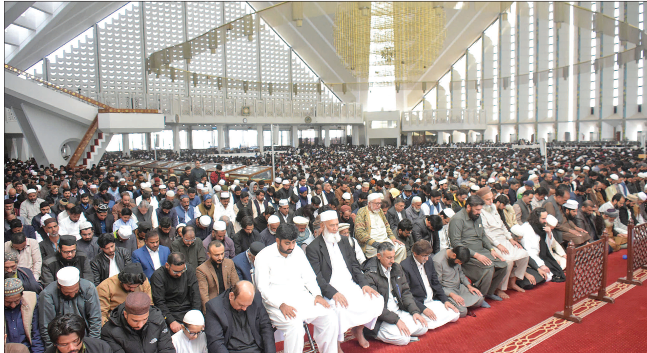
ISLAMABAD: People offering first Friday prayers during the holy fasting month of Ramadan at Faisal Mosque in the Federal Capital.

Sirajul Haq urged ruling parties to fulfill their manifesto promises, particularly advocating for the provision of free electricity for consumers using up to 300 units. He cautioned against imposing further burdens on the populace, anticipating harsher conditions from international financial bodies like the IMF, which could worsen inflation and taxation woes. He proposed combating corruption and curtailing non-development expenditures to strengthen the economy, while urging an end to the culture of excessive protocol. SABAH