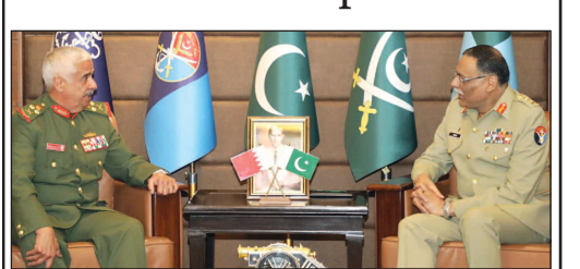
RAWALPINDI: General Sheikh Mohammed Bin Isa Bin Salman Al Khalifa, Commander Bahrain National Guard, called on General Sahir Shamshad Mirza, Chairman Joint Chiefs of Staff Committee, at Joint Staff Headquarters, Rawalpindi.

Reciprocating to his post, FM Ishaq Dar said Pakistan valued its ties with Ukraine. "Look forward to working with you to further solidify Pakistan-Ukraine relations for the benefit of our people and for strengthening our cooperation at int'l fora!" the foreign minister posted on X.