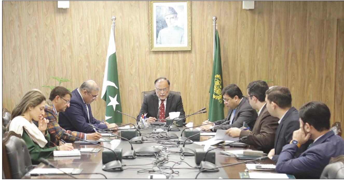
ISLAMABAD: Federal Minister for Planning Development & Special Initiatives Professor Ahsan Iqbal chaired a meeting to bring major reforms in Planning Commission on March 13. The meeting was attended by the Secretary Planning Ministry and Members Planning Commission.

The situation in Gaza was also discussed and both sides called for an immediate ceasefire and ensuring urgent provision of humanitarian assistance to the innocent Palestinians, particularly during the holy month of Ramadan. The two countries had excellent defence cooperation, and his visit would enhance these relations even further, the prime minister said, adding Pakistan and Bahrain enjoyed longstanding brotherly relations. He referred to the King Hamad Nursing Hospital that was under construction in Islamabad and said the flagship project was King's gift to the people of Pakistan. APP