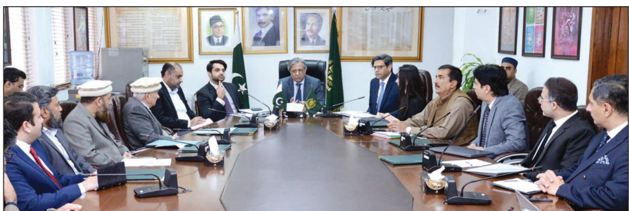
Federal Minister for Law and Justice, Azam Nazir Tarar chaired 2nd Meeting of the Anti Corruption Task Force.

Minister for SAFRON Amir Muqam said the collective efforts would be taken to address the challenges being confronting the people of the country. He termed the meeting between the prime minister and chief minister significant in the current scenario. APP