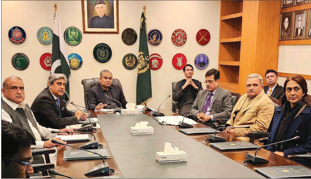
ISLAMABAD: Federal Minister for Interior Mohsin Naqvi chairing a meeting at Ministry of Interior.

Speaking on the occasion, the Minister for Defence said that the government would provide maximum support to cater for the needs of Armed Forces. APP