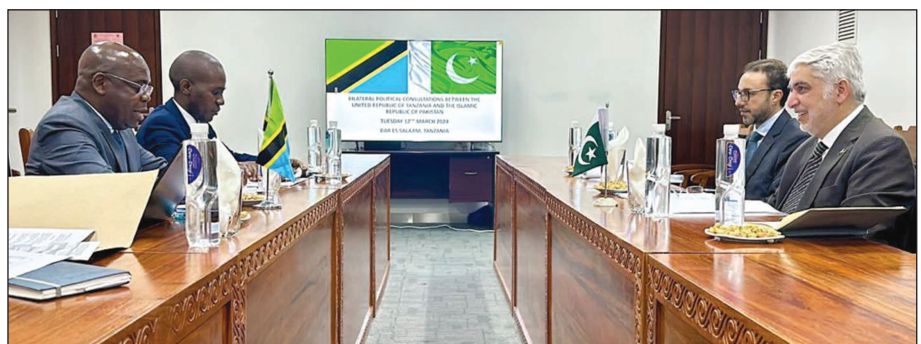
ISLAMABAD: Pakistan and Tanzania on Tuesday agreed to strengthen bilateral relations, in the areas of trade, defence, capacity building and educational cooperation. The consensus was reached during the inaugural session of Pakistan-Tanzania Bilateral Political Consultations held in Dar es Salaam, Tanzania.