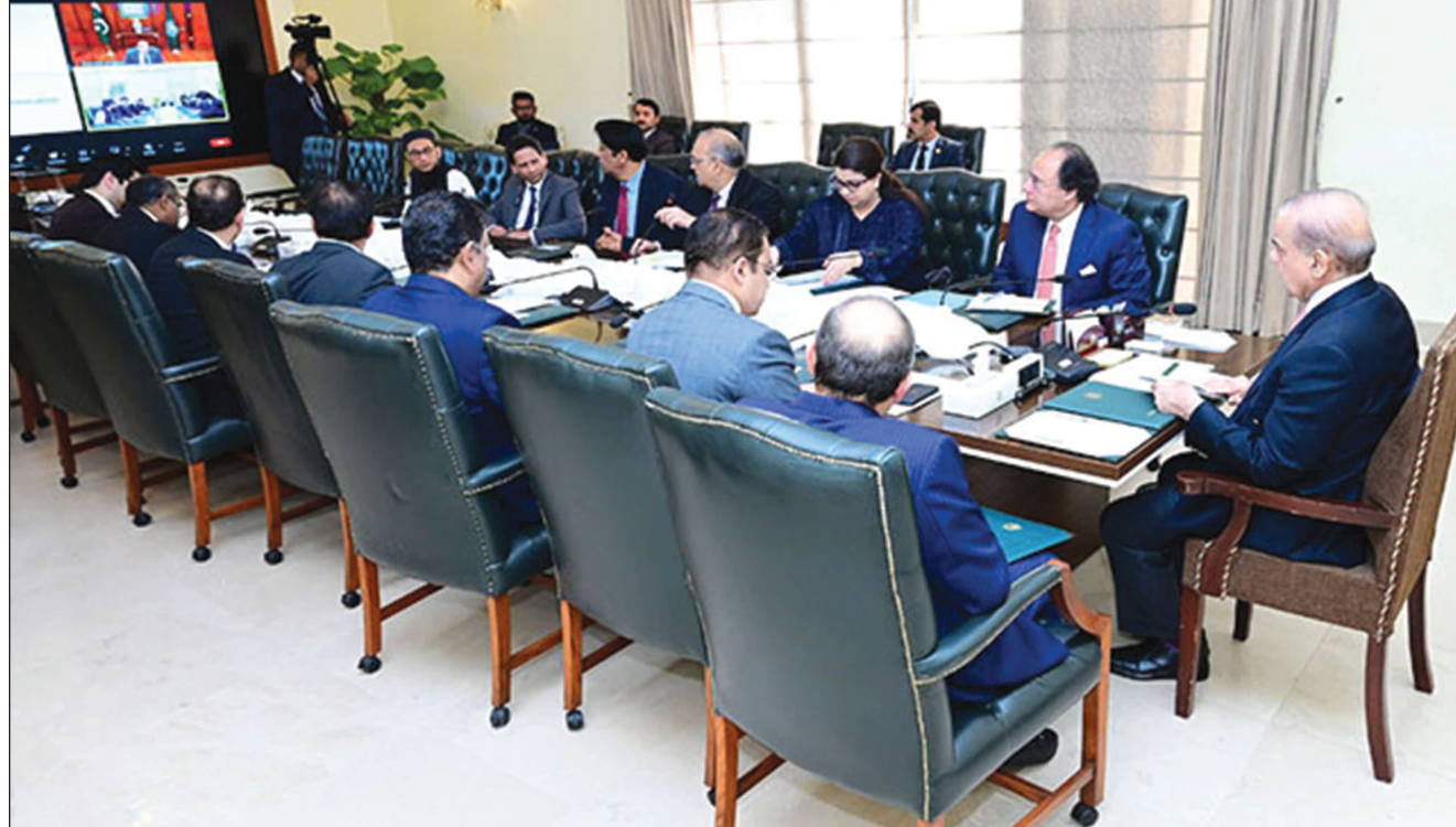
ISLAMABAD: PM Muhammad Shehbaz Sharif chairs a meeting regarding IT and Telecom Sector.