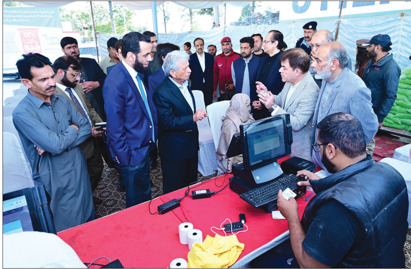
ISLAMABAD: Mr. Attaullah Tarar, Federal Minister for Information and Broadcasting along with Federal Minister, Rana Tanveer Hussain visited the utility store at Abpara Market on the directives of Prime Minister Muhammad Shehbaz Sharif to review the quality of the edibles being sold at subsidized rates under the Ramazan Relief Package 2024. (Story on page 1)

Candidates interested in contesting the elections have been asked to obtain nomination papers from the Election Commission headquarters and provincial election commissioners of Punjab, Sindh, Balochistan, and Khyber Pakhtunkhwa. Nomination papers can be deposited with the relevant returning officers on March 15 and 16. INP