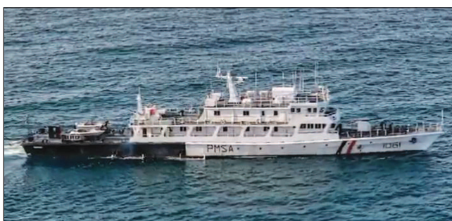
Pakistan Navy and Pakistan Maritime Security Agency have achieved significant success in the search operation for the missing fishermen of Al-Asad boat.

Pakistan Navy and Pakistan Maritime Security