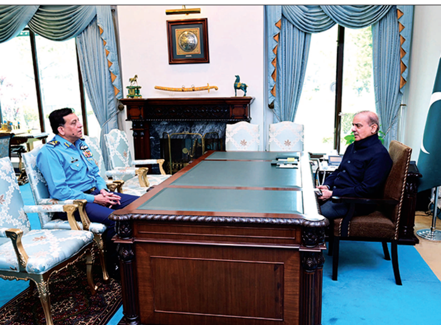
ISLAMABAD: Chief of Air Staff, Air Chief Marhsal Zaheer Ahmed Babar Sidhu calls on Prime Minister Muhammad Shehbaz Sharif.

Candidates can submit their nomination papers to their respective Returning Officers on Friday and Saturday. Besides, any additional information regarding the Senate elections can be obtained at 051-9219335. SABAH