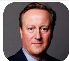
Lord David Cameron

The writer is a climate governance expert who works for global development organisations in the fields of research, advisory, policy analysis, and legislative reforms.