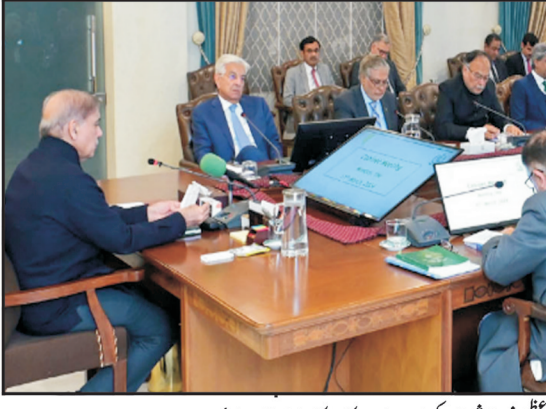
اسلام آباد، وزیر اعظم شہباز شریف کی زیر صدارت کابینہ کا پہلا اجلاس جاری ہے۔