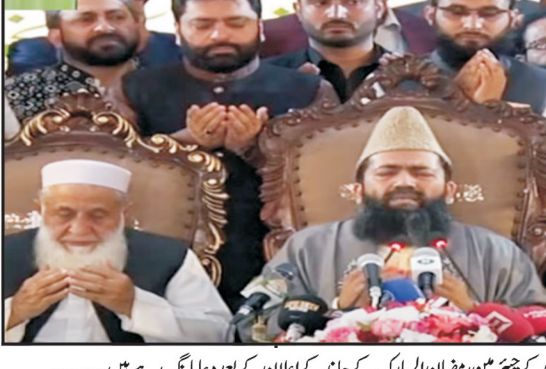
اسلام آباد، پی پی پی کے رہنما پیر ستر گورنر نے ملاقات کیلئے درخواستیں دائر کر دی ہیں۔

ہوئی عوام اس کی شدید مذمت کرتے ہیں، جب تک مینڈیٹ بحال نہیں ہوتا احتجاج جاری رہے گا۔