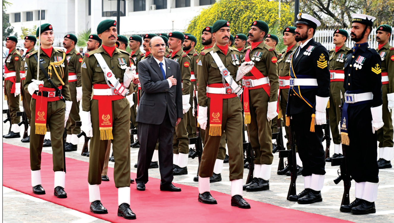
ISLAMABAD: President Asif Ali Zardari inspecting the Guard of Honour, at Aiwan-e-Sadr.

Registrar Supreme Court of Pakistan conducted the proceedings of oath taking ceremony. Officers and staff of the Supreme Court of Pakistan were also present on the occasion.